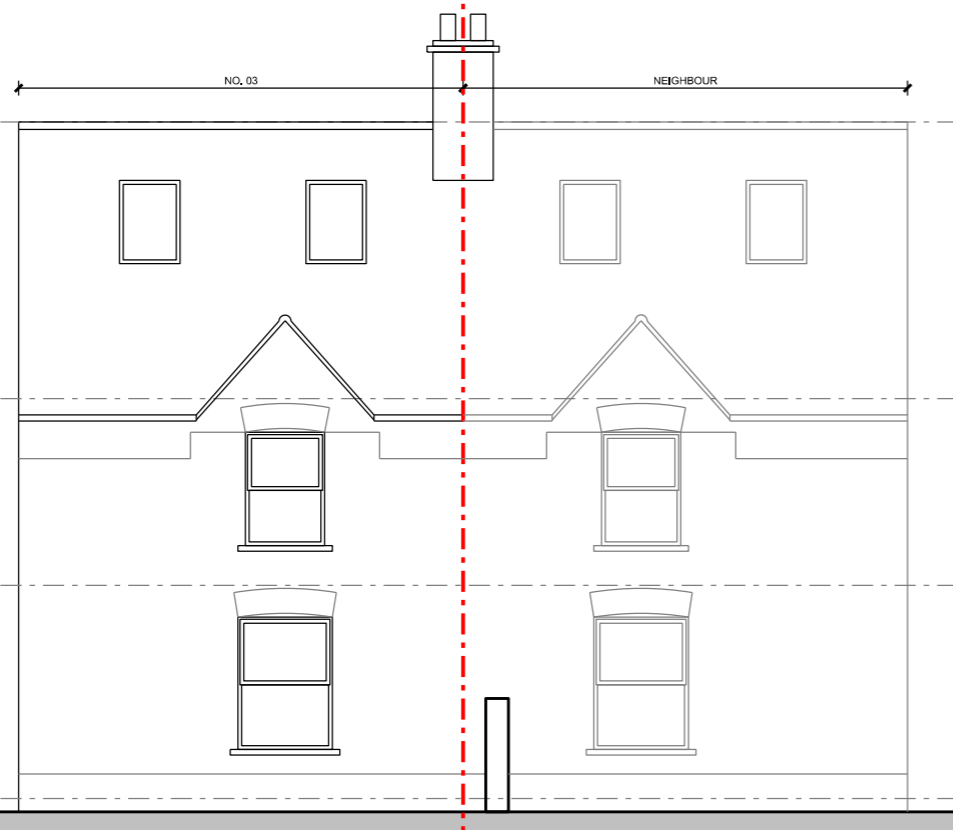
01 EXISTING EAST ELEVATION