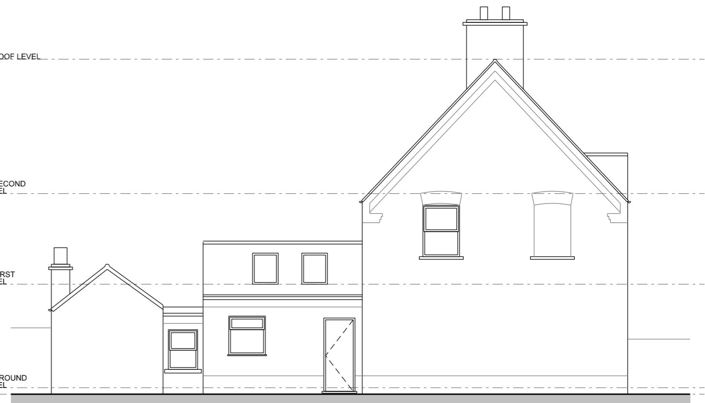
02 EXISTING SOUTH ELEVATION