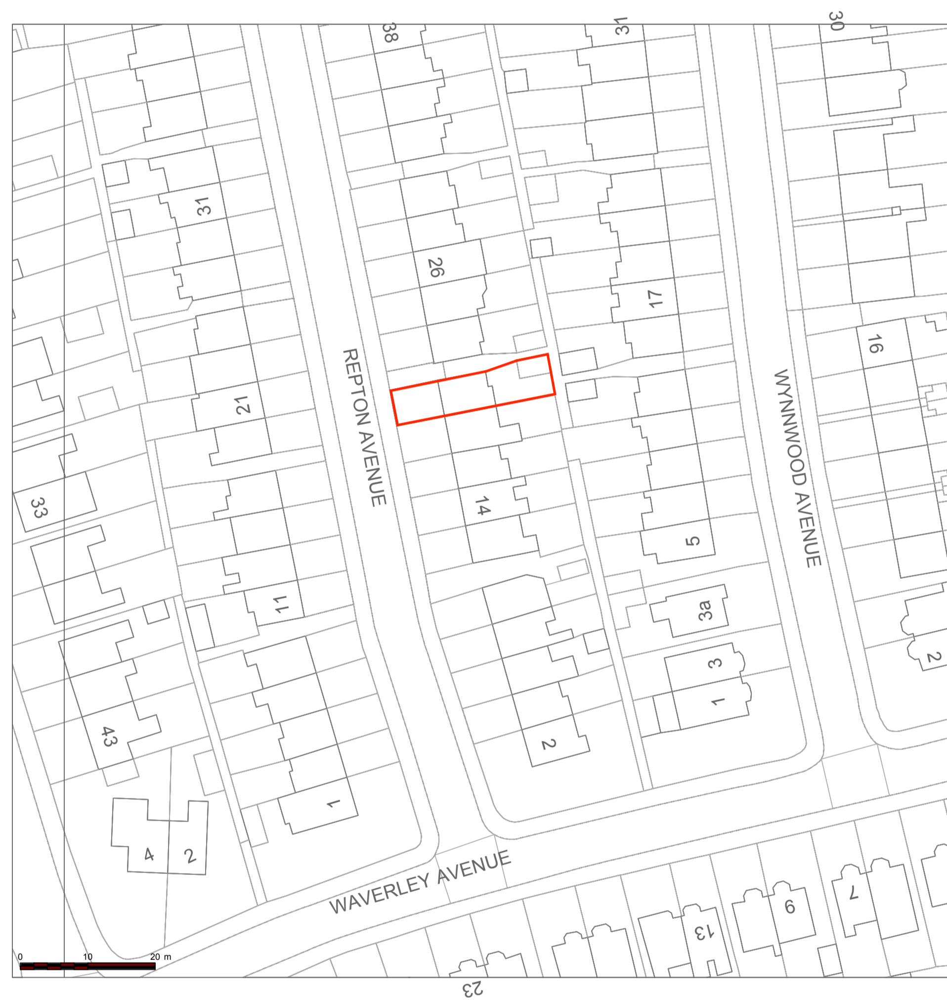
Proposed Site / Location Plans Rev 001