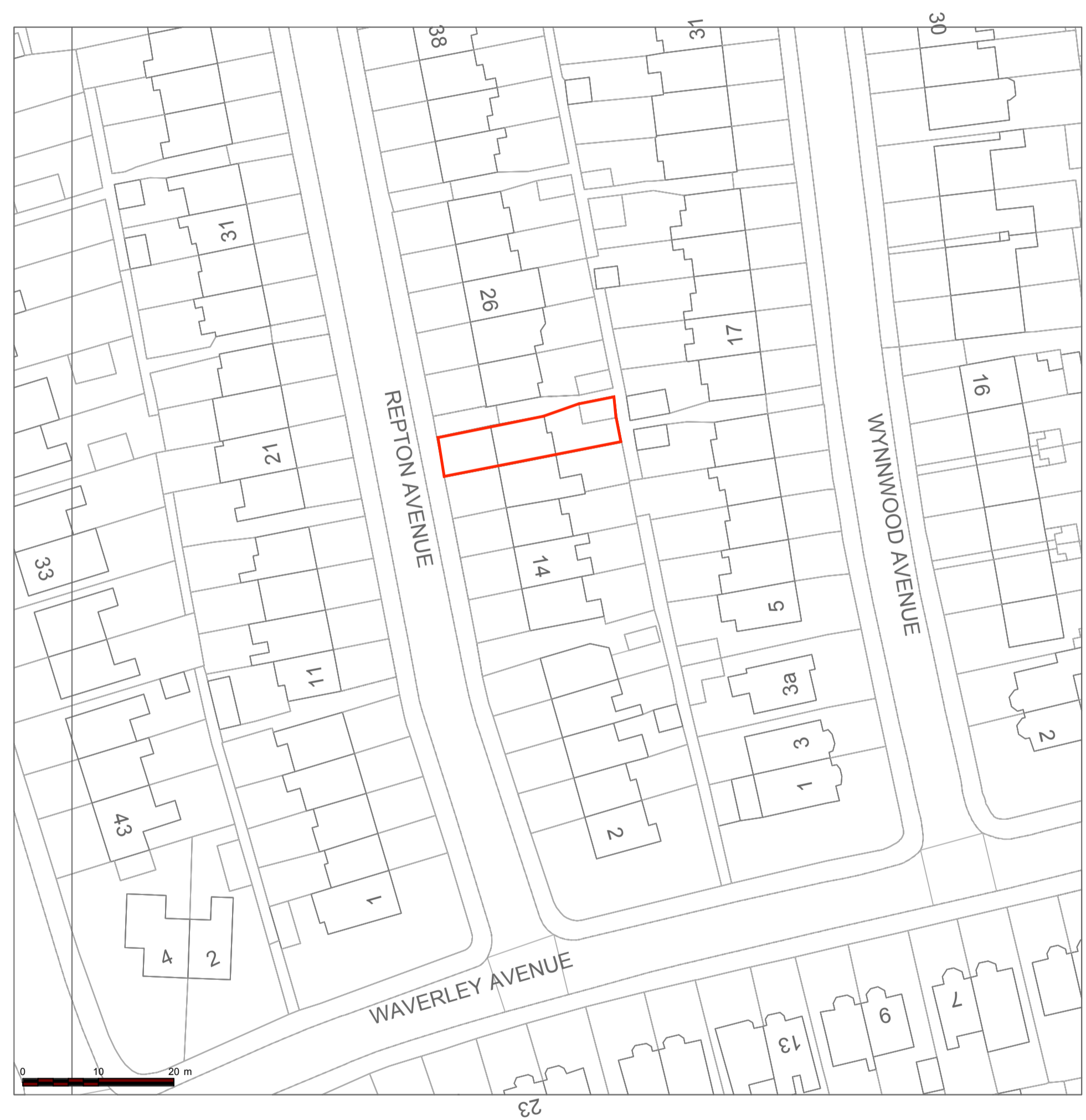
Existing Site / Location Plans Rev 001