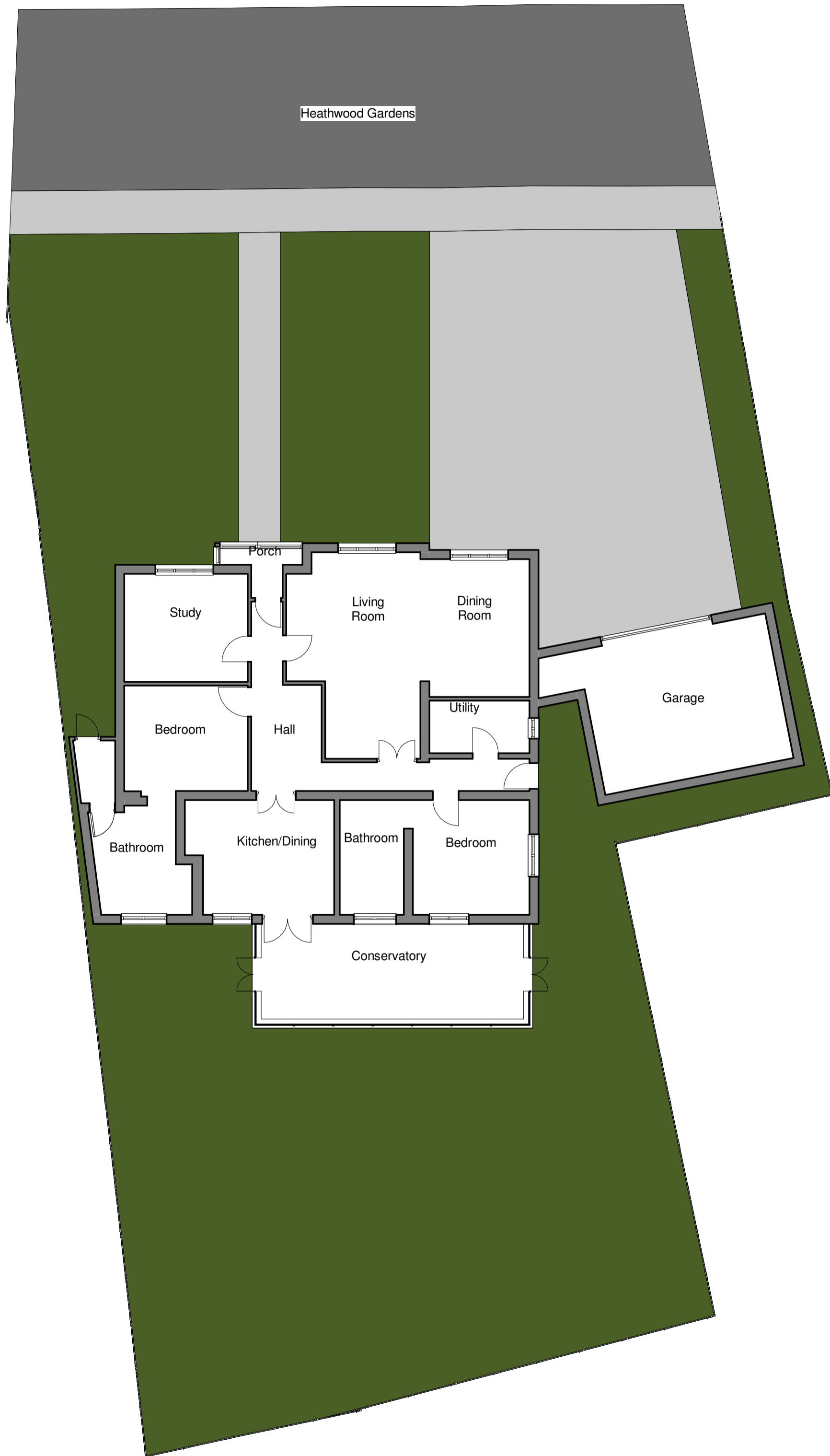
Ground Floor - Existing 1 : 100