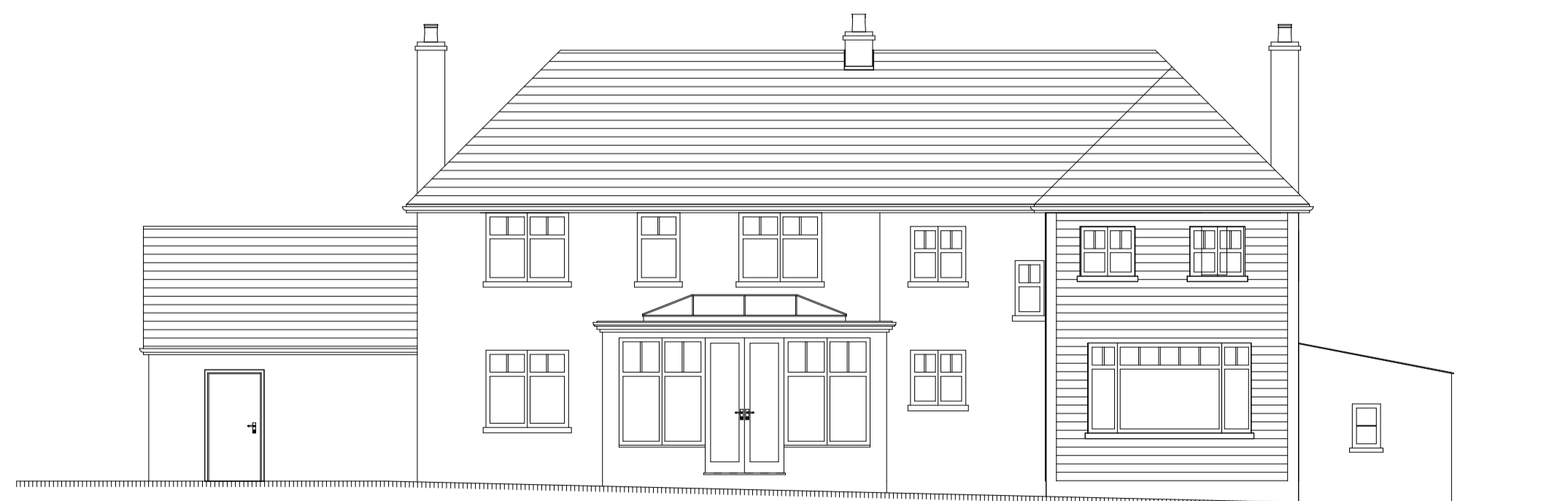
EXISTING NORTH EAST ELEVATION Scale 1:100