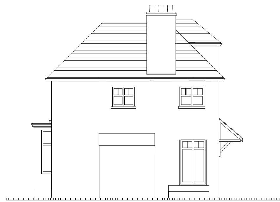
EXISTING NORTH WEST ELEVATION Scale 1:100