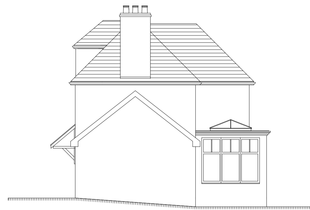
EXISTING SOUTH EAST ELEVATION Scale 1:100