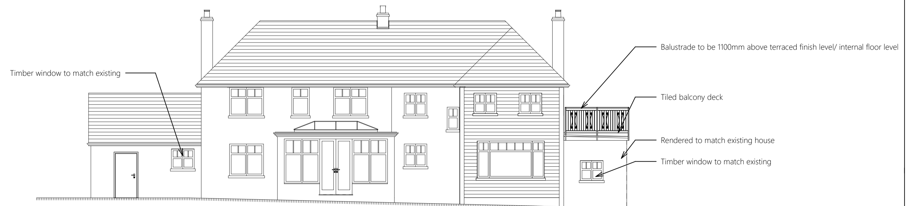
PROPOSED NORTH EAST ELEVATION Scale 1:100