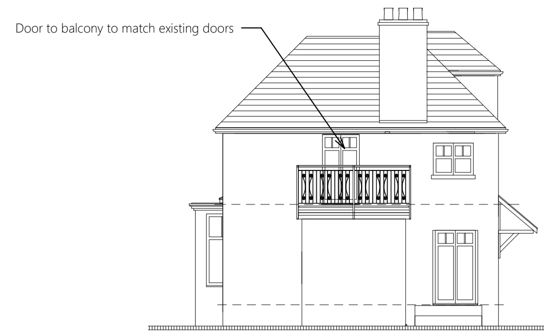
PROPOSED NORTH WEST ELEVATION Scale 1:100