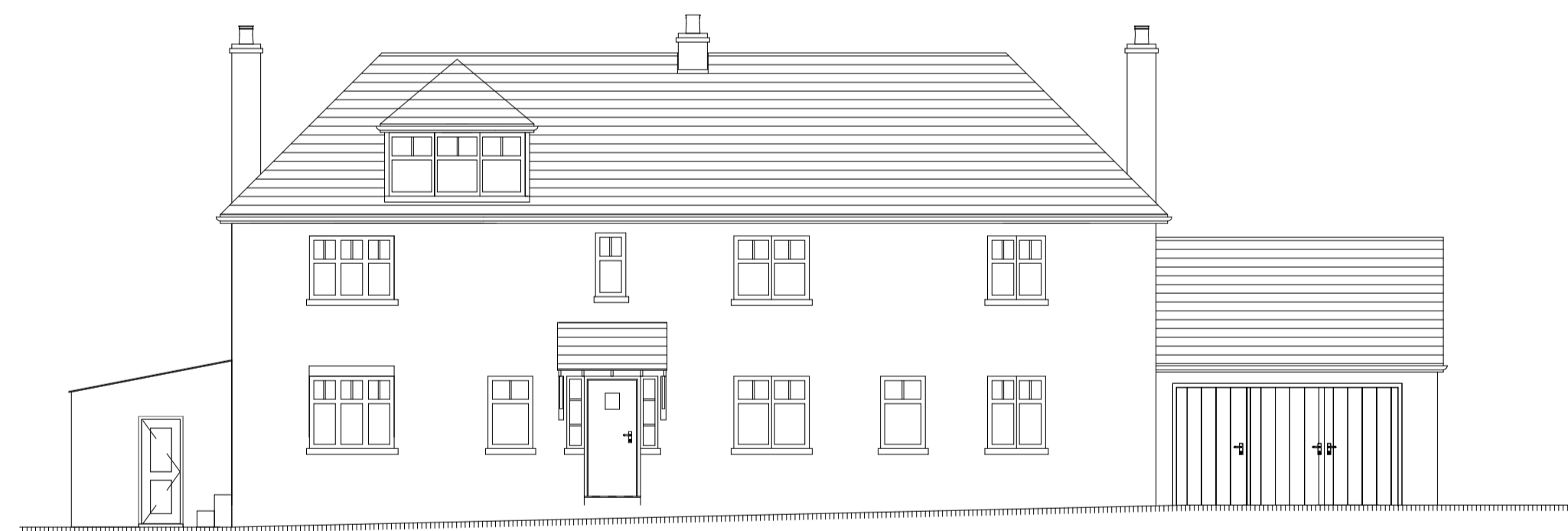
EXISTING SOUTH WEST ELEVATION Scale 1:100