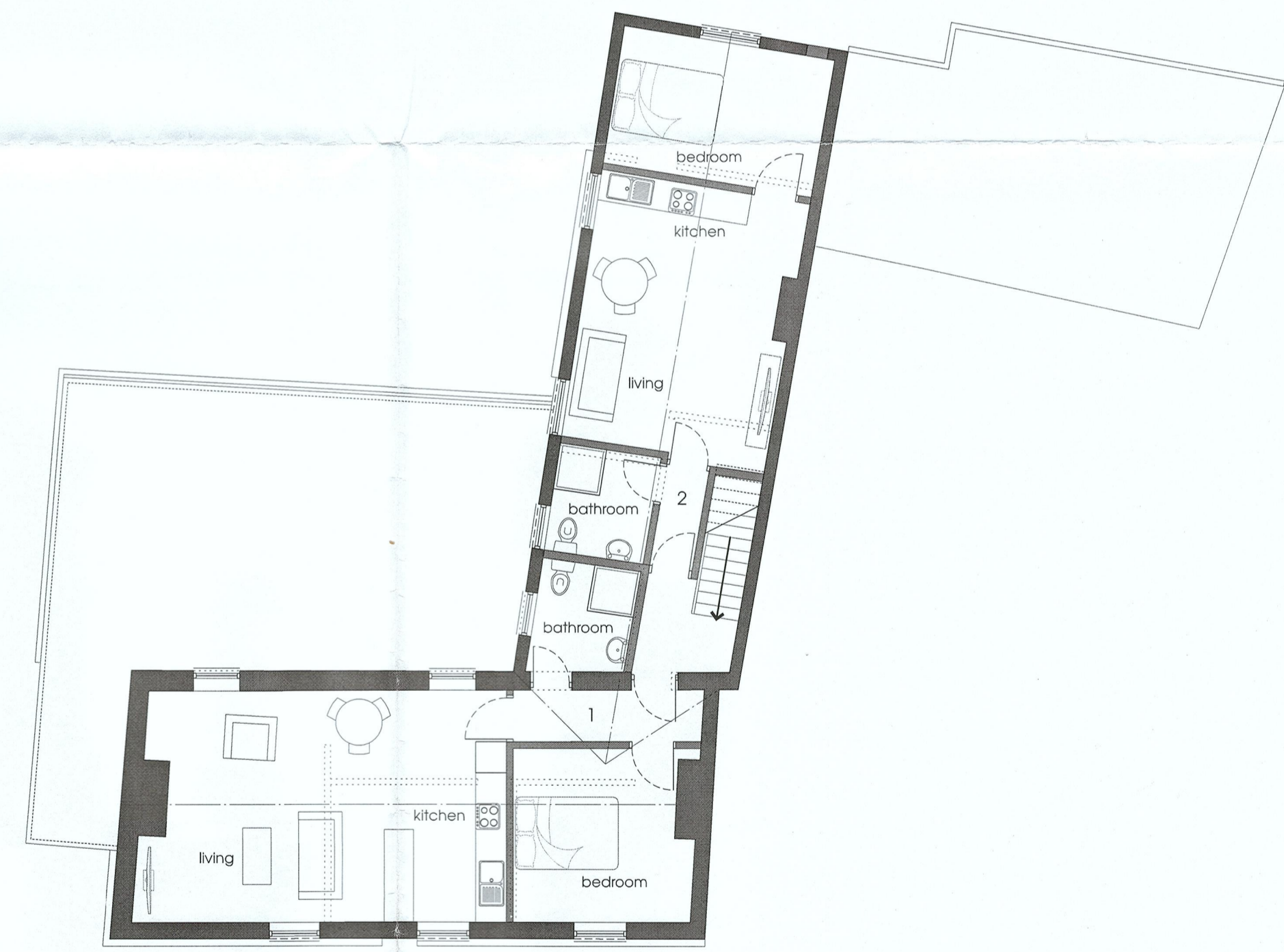
PROPOSED FIRST FLOOR PLAN / 1:100

P & ER DEVELOPMENT CONTROL REC'D 21 MAR 2022