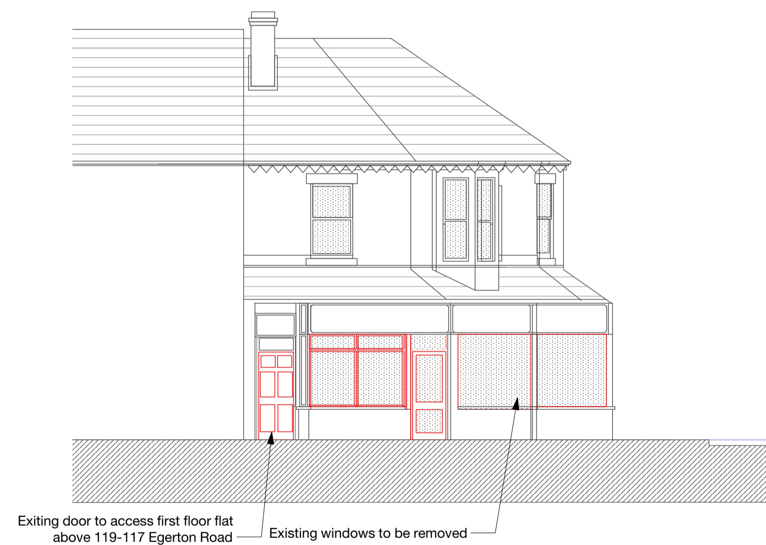
2 SIDE ELEVATION - PLEASANT STREET Scale: 1:100