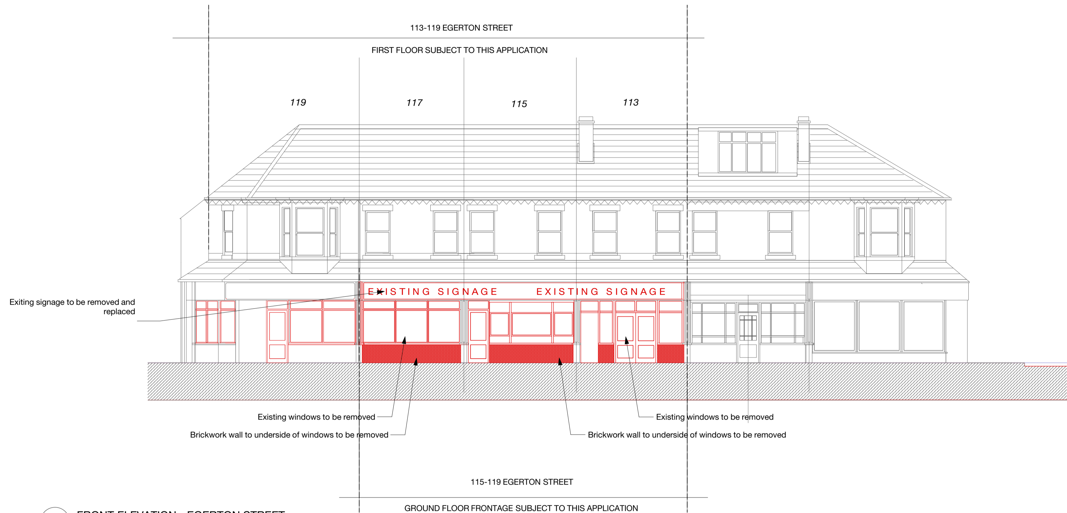
1 FRONT ELEVATION - EGERTON STREET Scale: 1:100

INFORM THE ARCHITECTS BEFORE ANY WORK STARTS IF THIS DRAWING EXCEEDS THE QUANTITIES IN ANY WAY