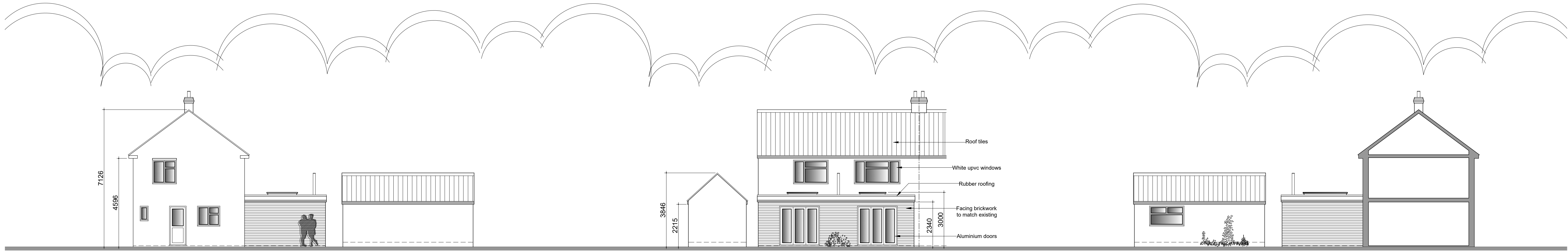
Side Elevation North West