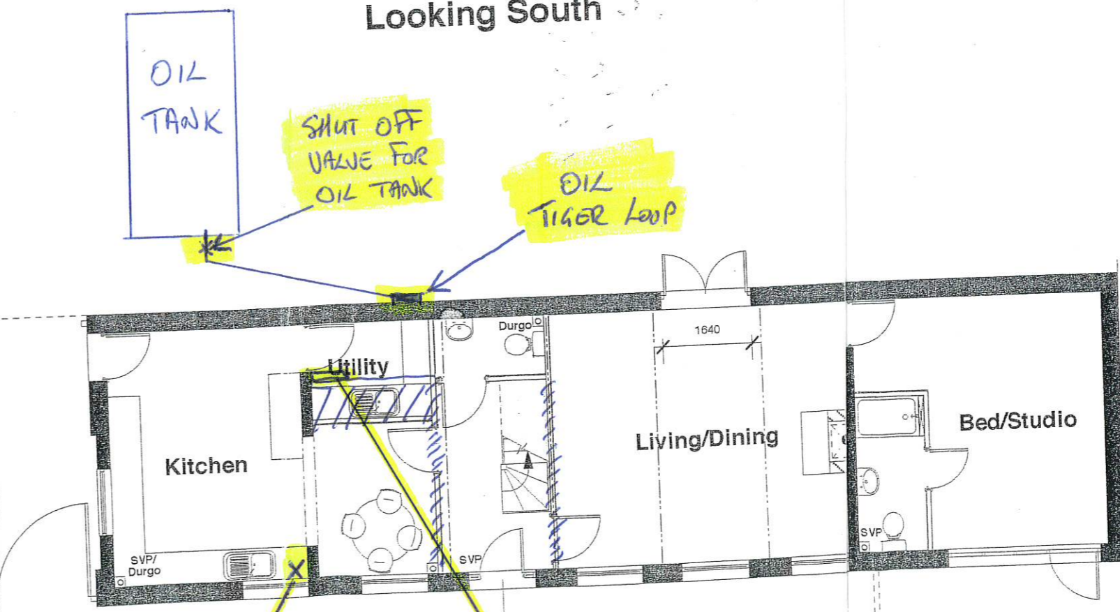
Shippon Barn 2