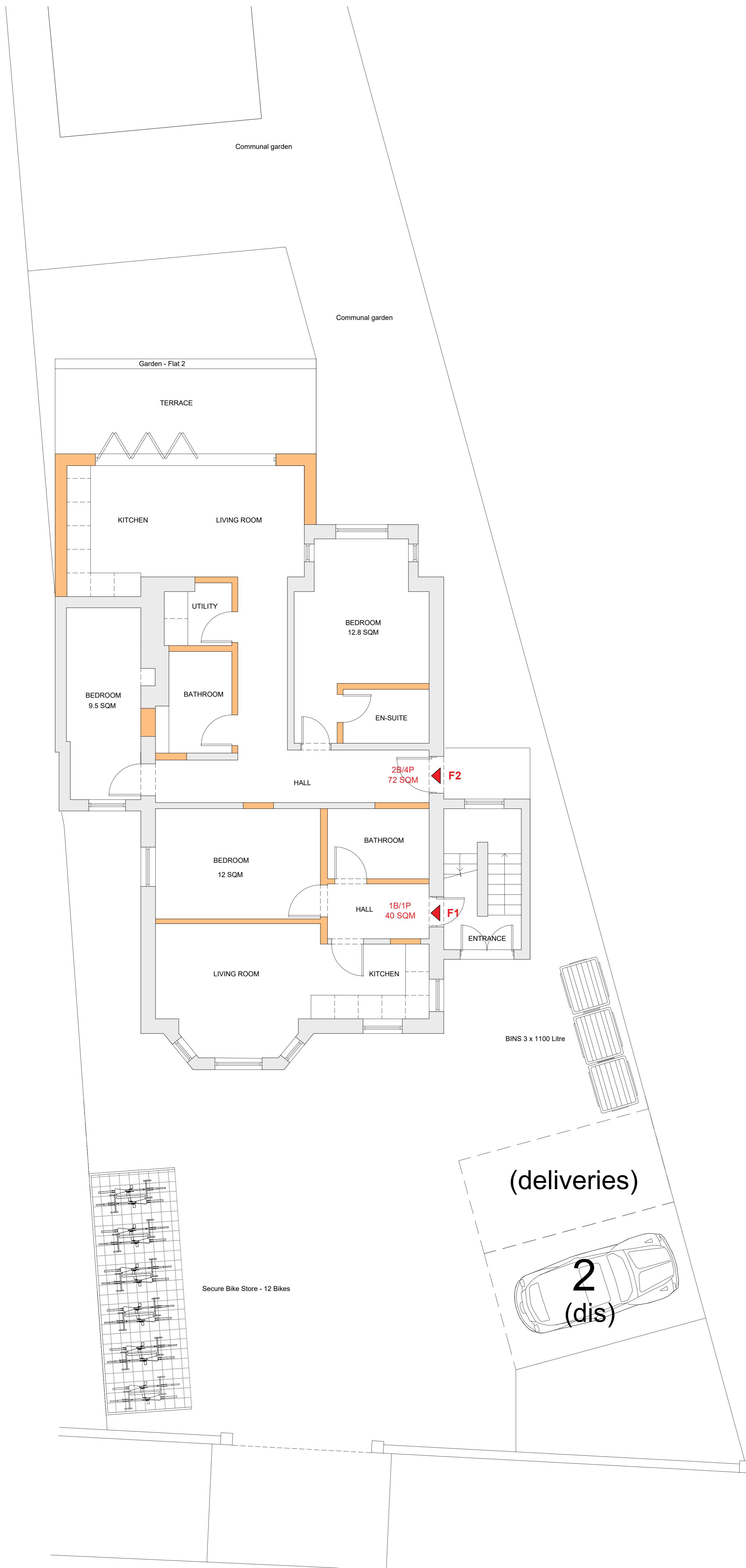
Bin Store / Cycle Store / Car Parking / rear garden area - Proposed - 1:100@A1