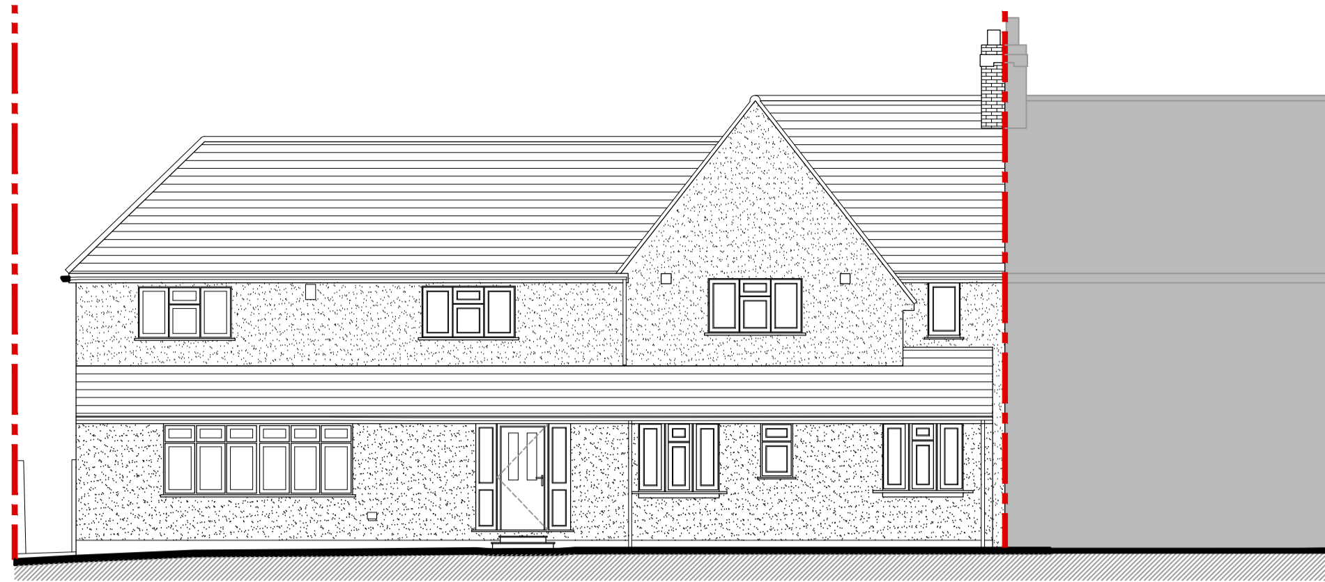
1 EXISTING FRONT ELEVATION - NORTH WEST 1:100