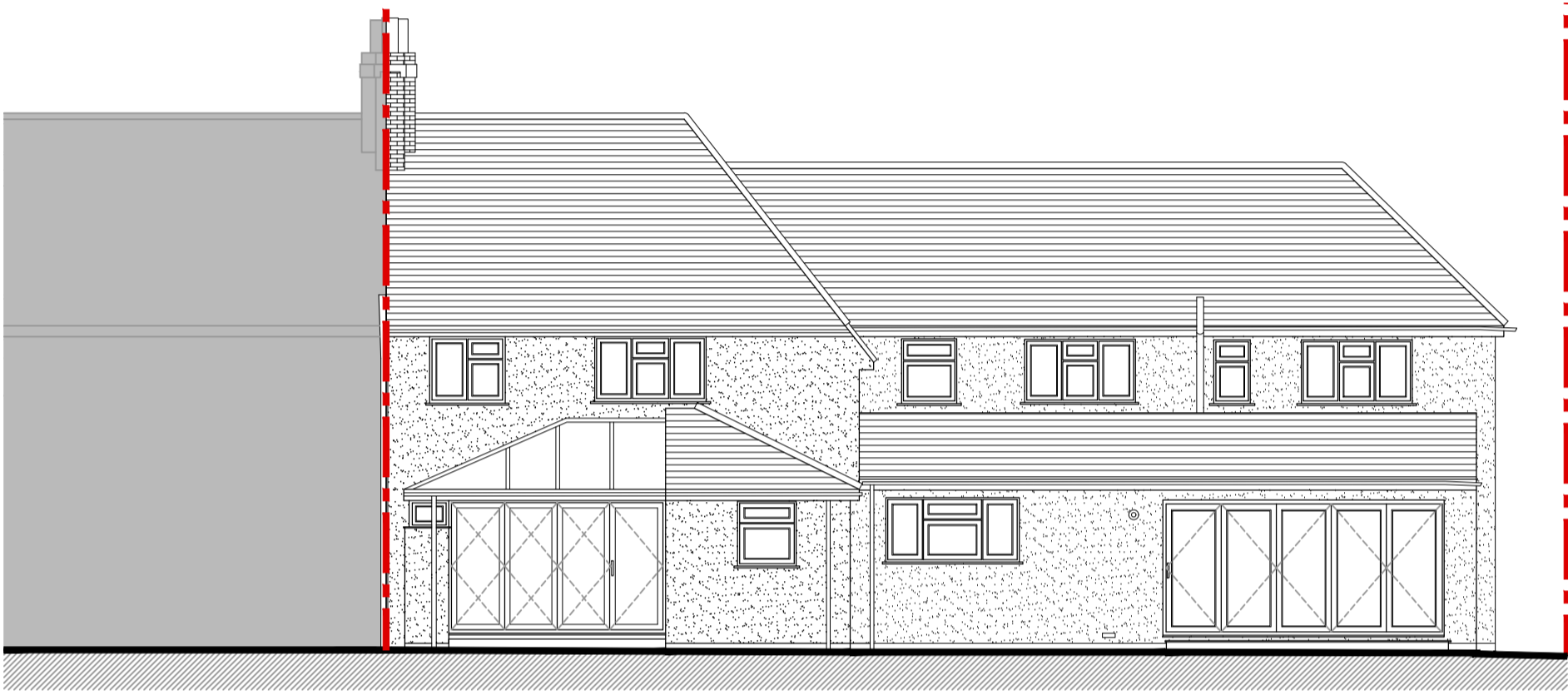
3 EXISTING REAR ELEVATION - SOUTH EAST 1:100