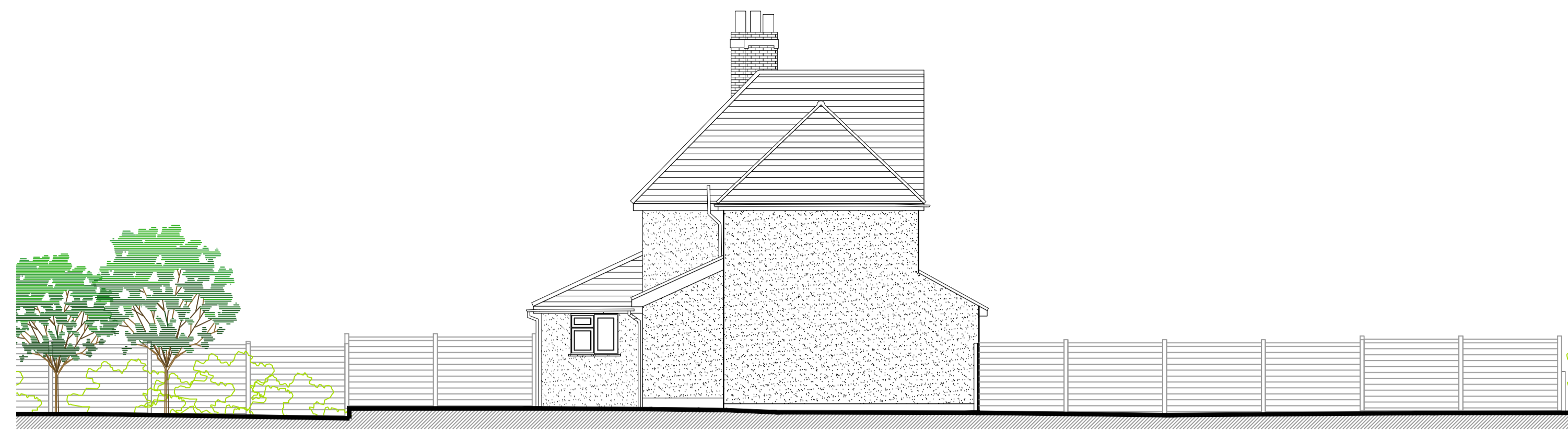
2 EXISTING SIDE ELEVATION - NORTH EAST 1:100