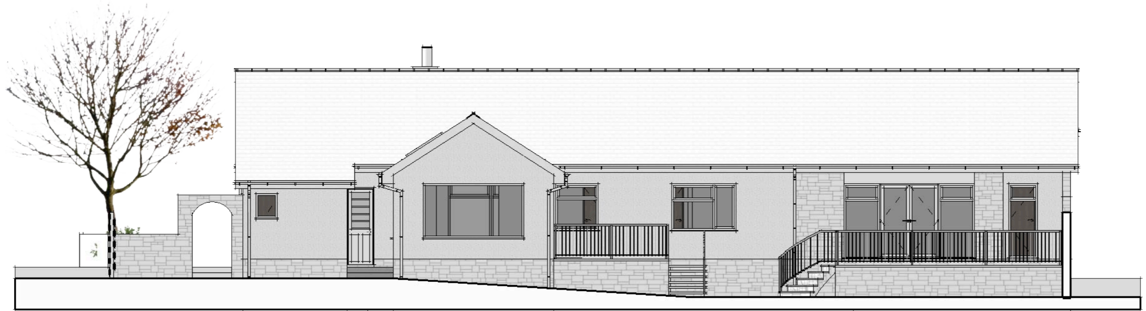
E :: EXISTING REAR ELEVATION 2 scale: 1:100