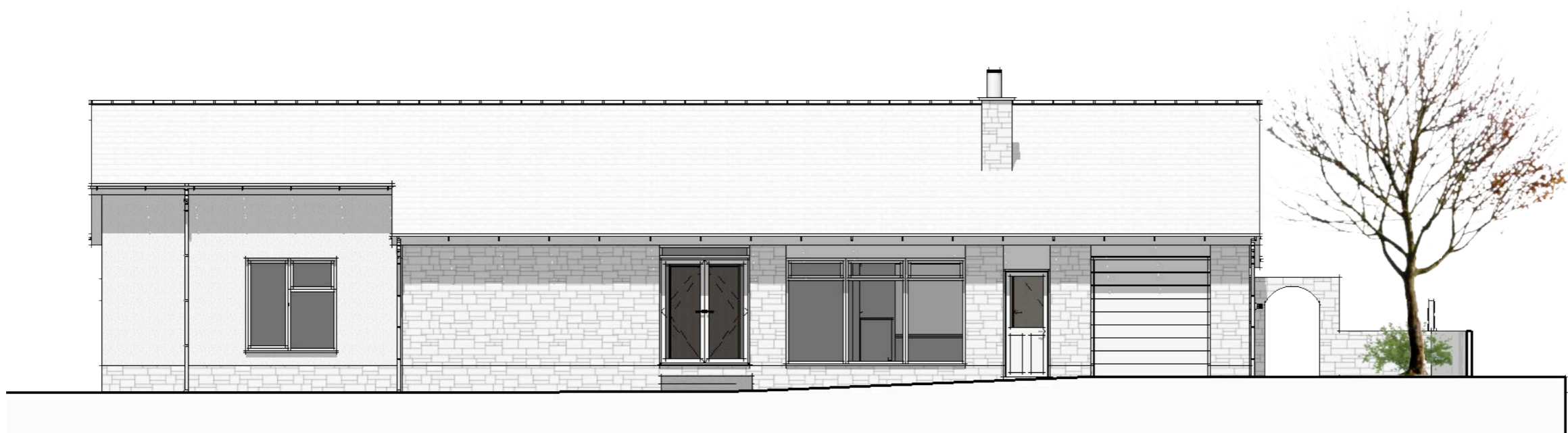
E :: EXISTING FRONT ELEVATION 2 scale: 1:100