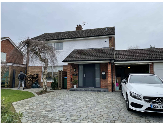
STREET VIEW OF EXISTING PROPERTY