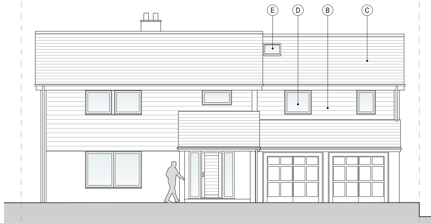
PROPOSED NORTH ELEVATION 1:100@A3