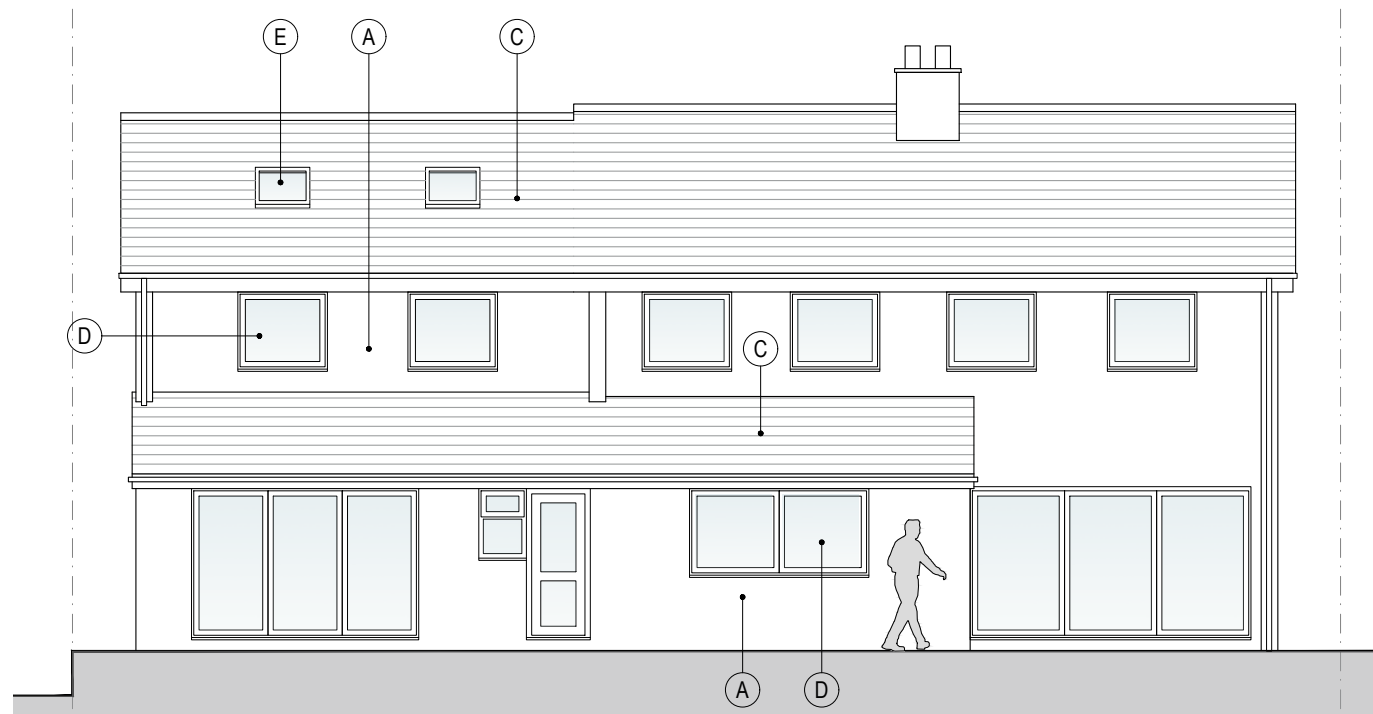
PROPOSED SOUTH ELEVATION 1:100@A3