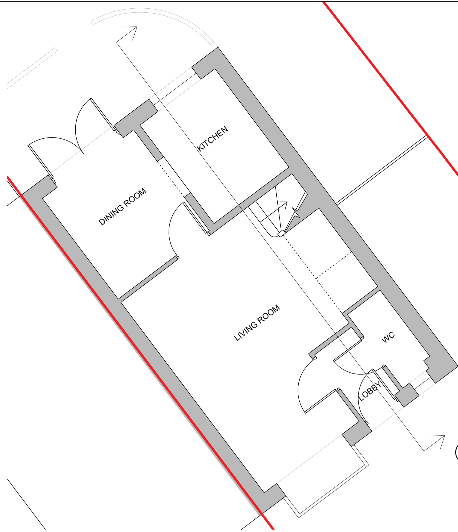
EXISTING GROUND FLOOR PLAN SCALE 1/50