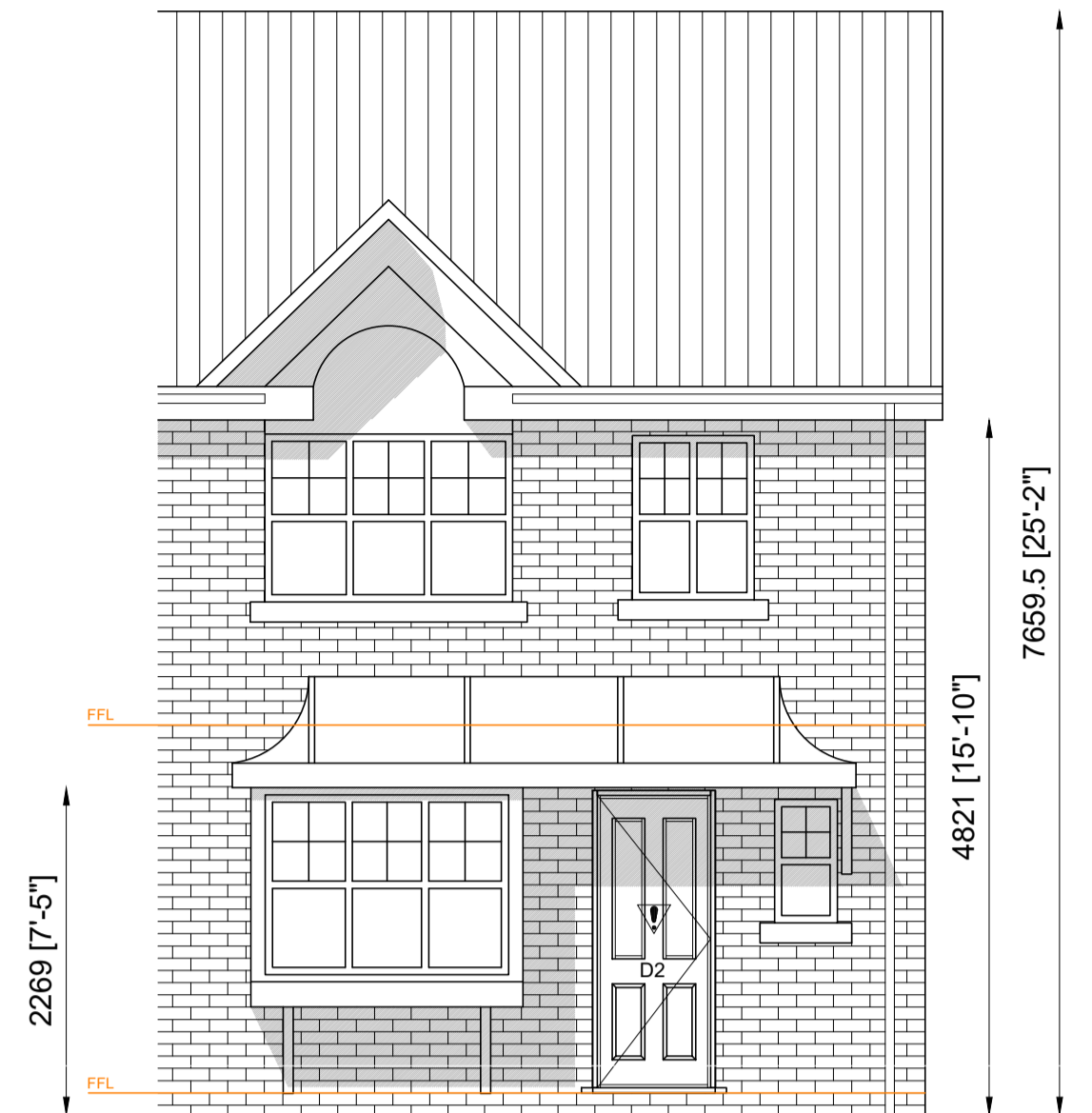
EXISTING NORTH-EAST ELEVATION SCALE 1/50