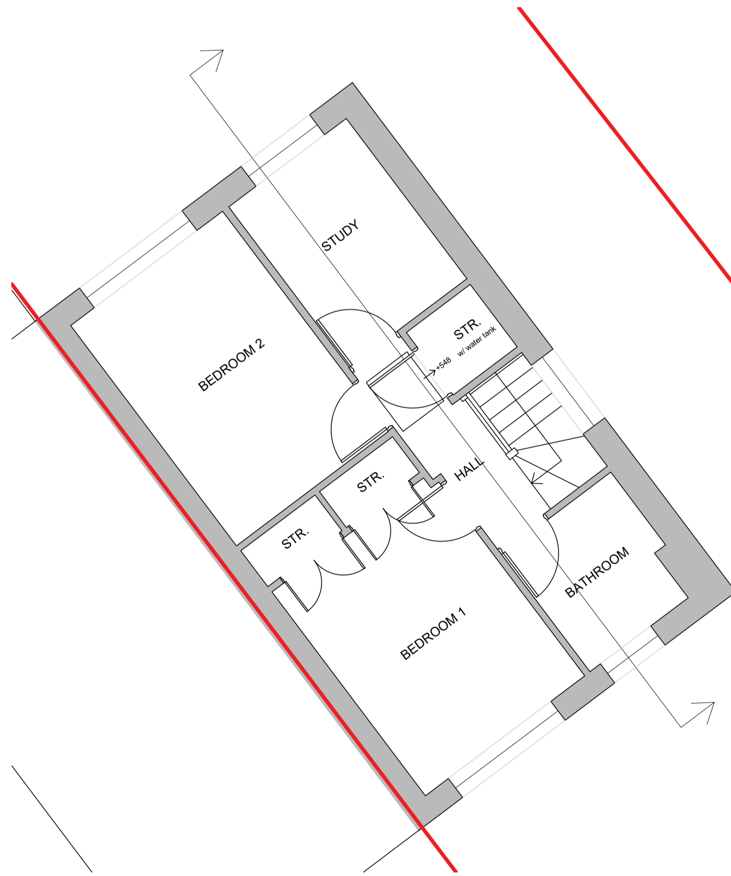
EXISTING FIRST FLOOR PLAN SCALE 1/50