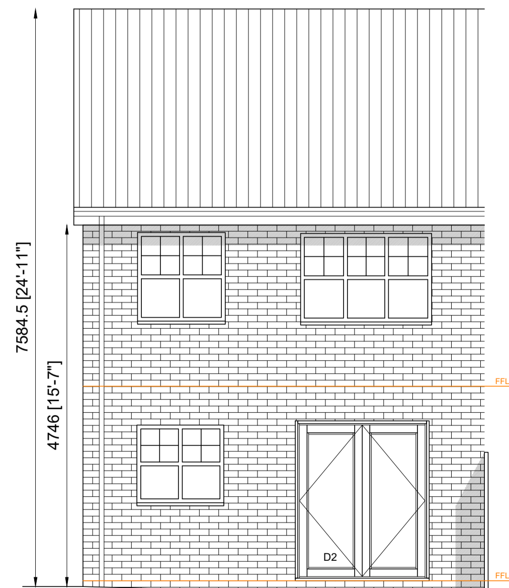
EXISTING SOUTH-WEST ELEVATION SCALE 1/50