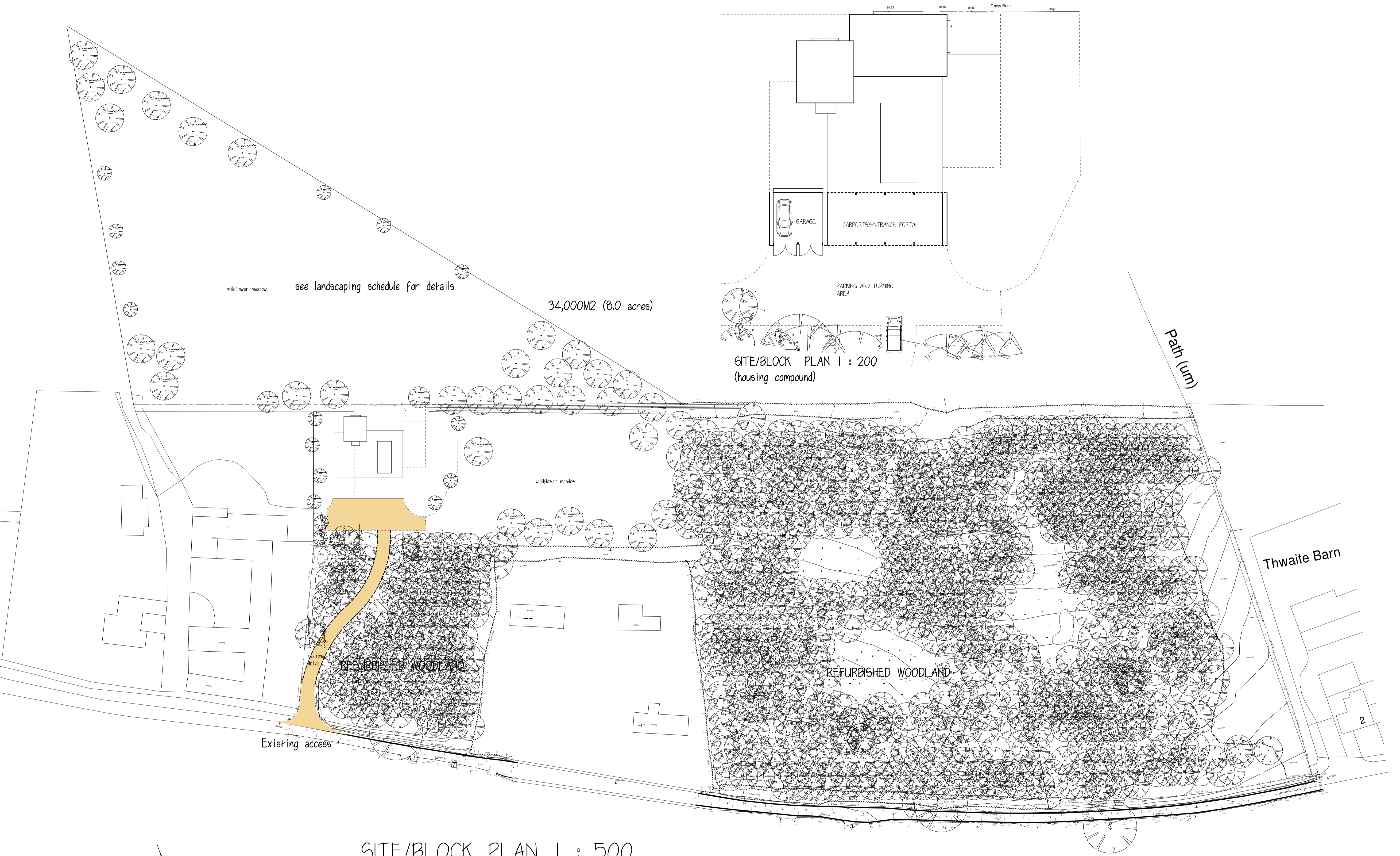
SITE/BLOCK PLAN 1 : 500 (showing extent of boundary)