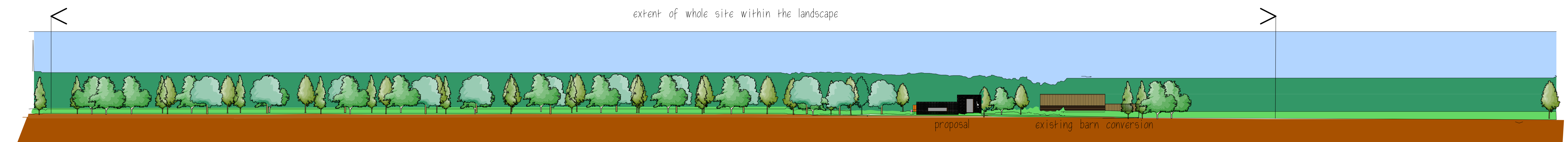
distant VIEW across the fields of entire site from nearest public highway 1 : 500 (see Landscape appraisal for details)