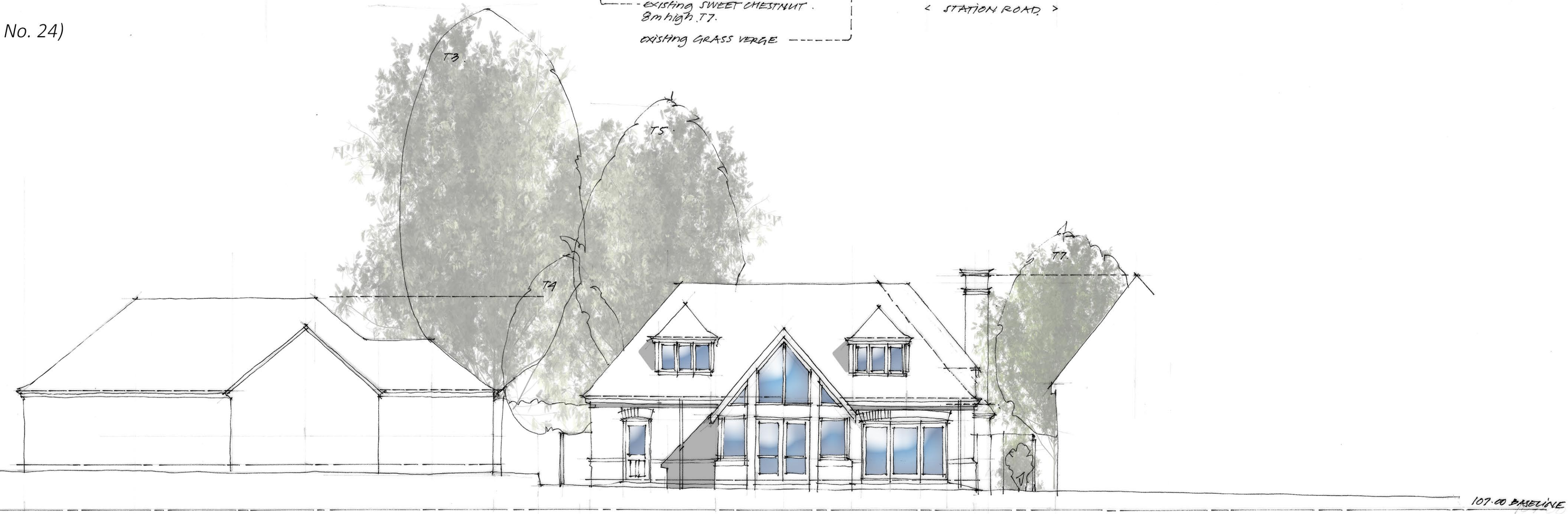
Proposed Rear Elevation [Scale 1:100]