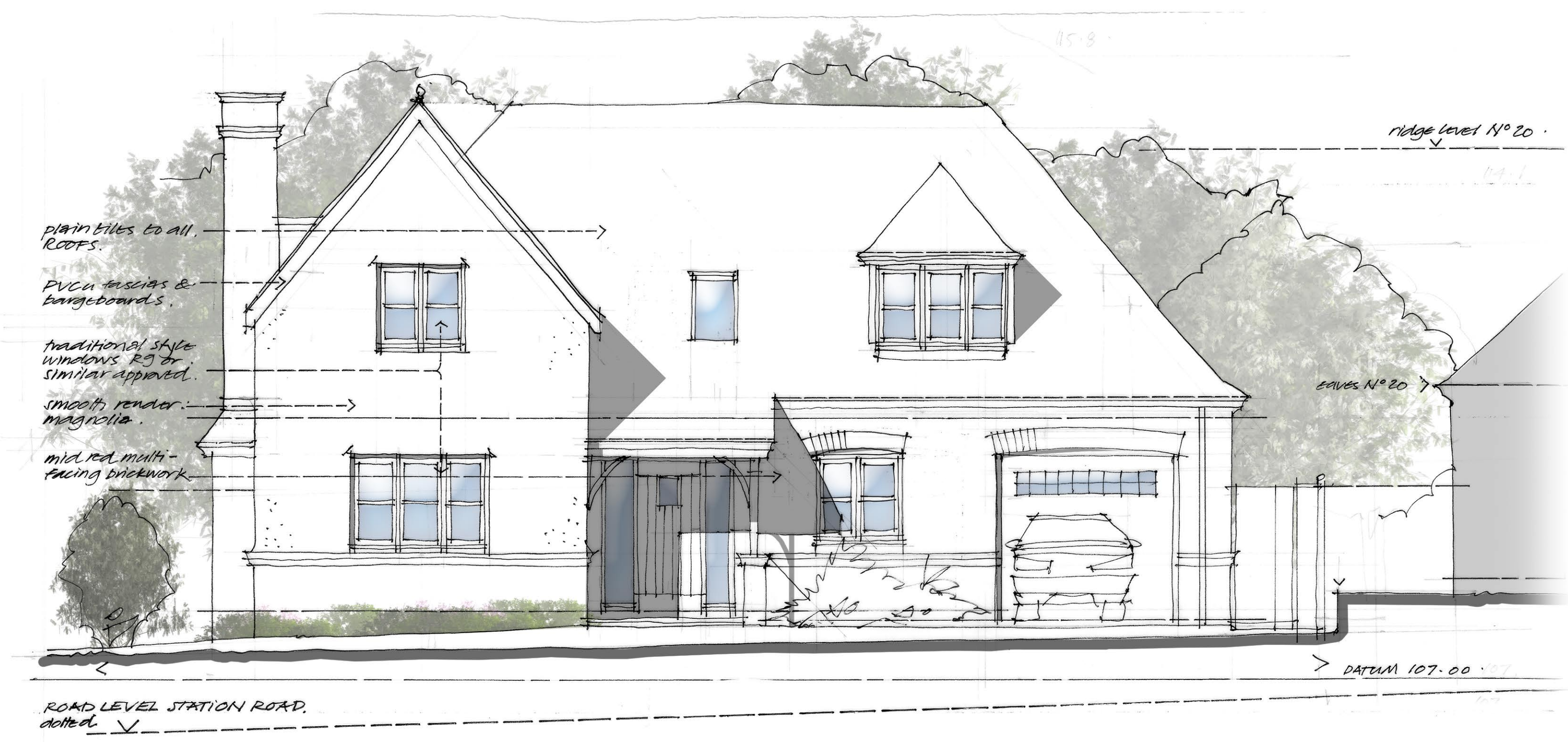
Proposed Front Elevation [Scale 1:50] [Total Area Circa 2110 sq/ft Excluding garage]

The Builder is to check and verify all buildings and site dimensions, levels and sewer invert levels prior to commencement of work. Do not scale off this drawing, work to figured dimensions only. This drawing must be read and checked with all structural and relevant specialist drawings. The Builder is to comply in all respects with the current Building Regulations and latest Codes of Practice. Copyright of this drawing and of work executed from it remain the property of BHB Ritchie & Ritchie Ltd.