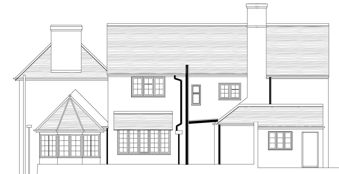
Side Elevation (SOUTH)