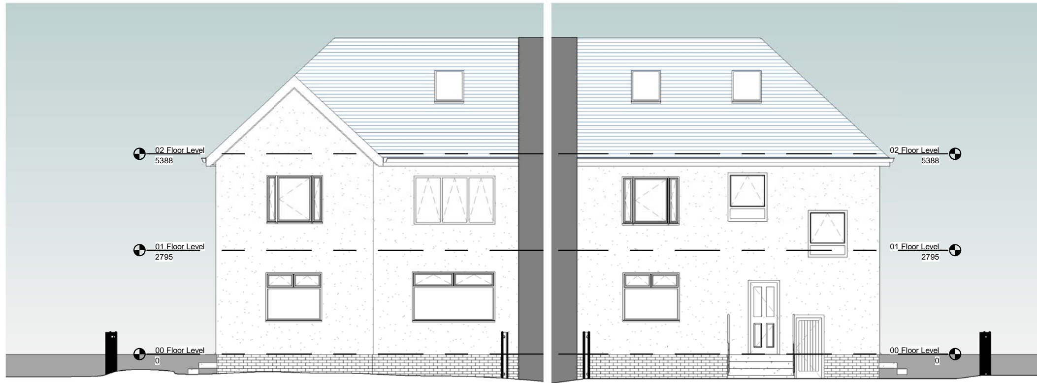
1 Existing Front Elevation 1 : 100