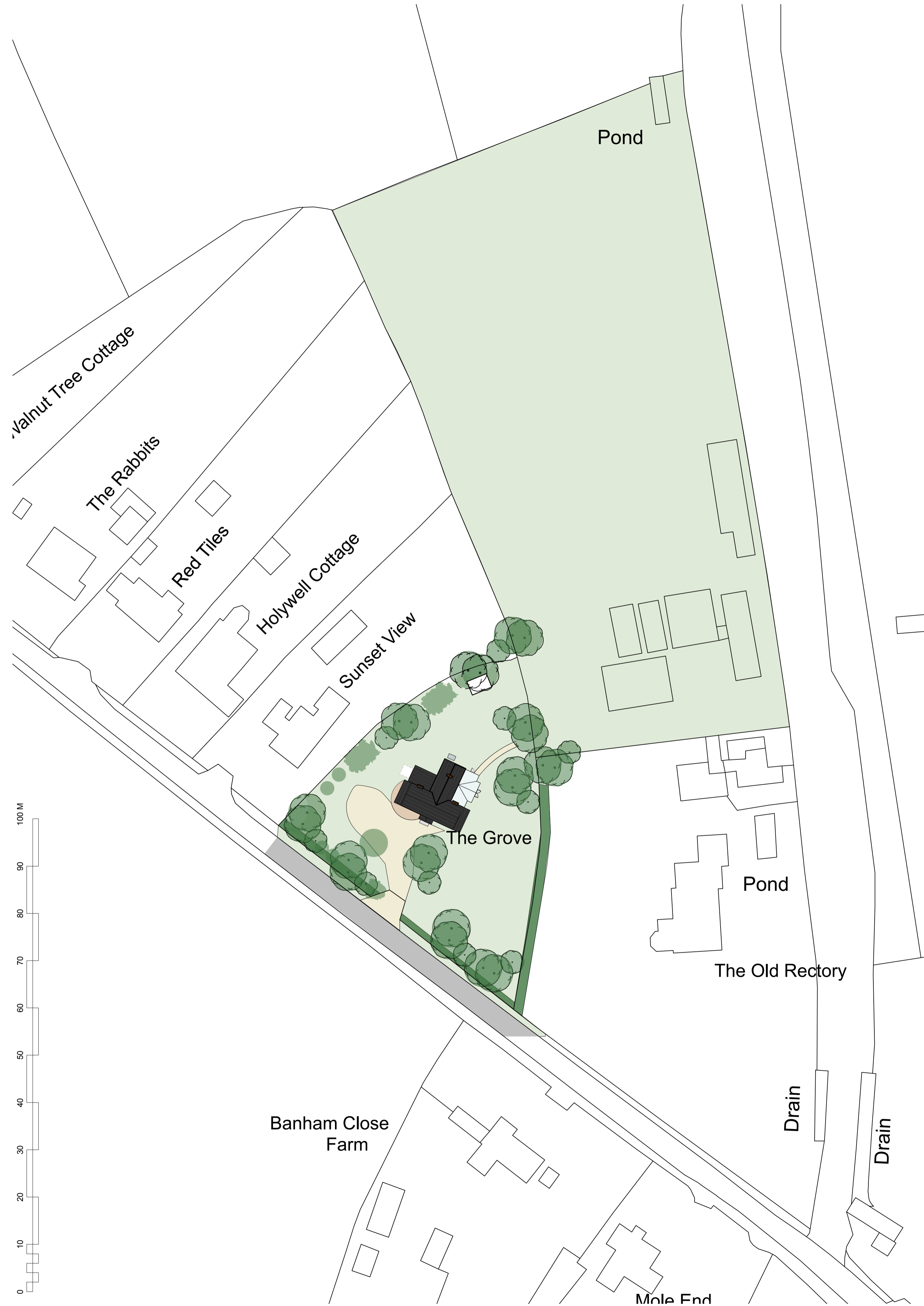
SITE BLOCK PLAN 1:500

General Notes 1. Do not scale this drawing. All dimensions to be as noted. Contractor to check all dimensions on site before carry out works. 2. This drawing is for the private and confidential use of the client for whom it was undertaken and it should not be reproduced in whole or in part or relied upon by third parties for any use without the express written authority of Beech Architects Limited.