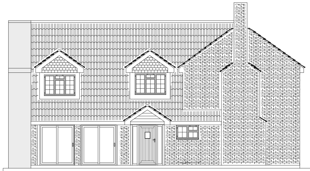
front (E) elevation

NOTES: No part of this drawing may be reproduced whatsoever without written permission of Davtee Ltd. All dimensions to be checked on site before any work commences. Any discrepancies to be reported to the supervising officer.