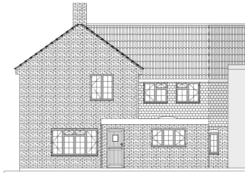
rear (W) elevation