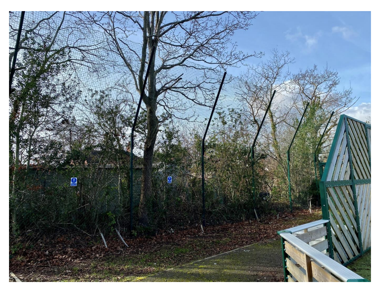
Picture showing current cantilever ball retention fence on far boundary. This will be relocated on the newly erected 3m green mesh fence.