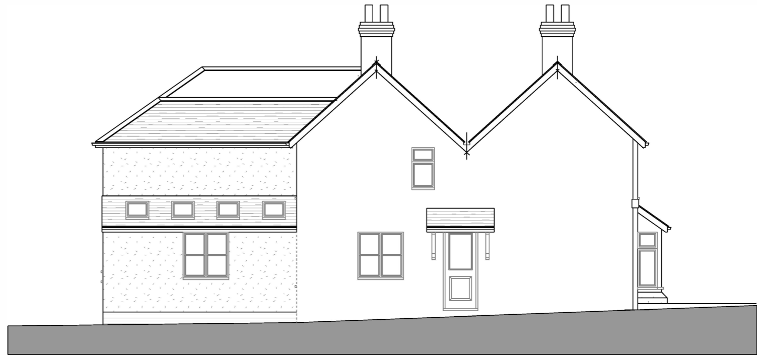
PROPOSED SIDE ELEVATION - WEST Scale 1:100 @ A3