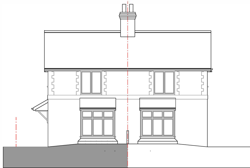
PROPOSED FRONT ELEVATION - SOUTH Scale 1:100 @ A3