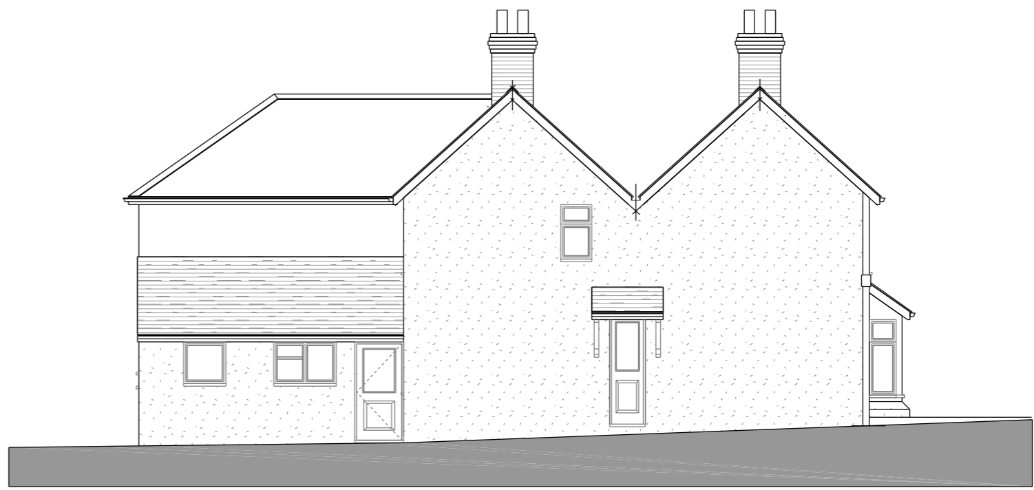
EXISTING SIDE ELEVATION - WEST Scale 1:100 @ A3