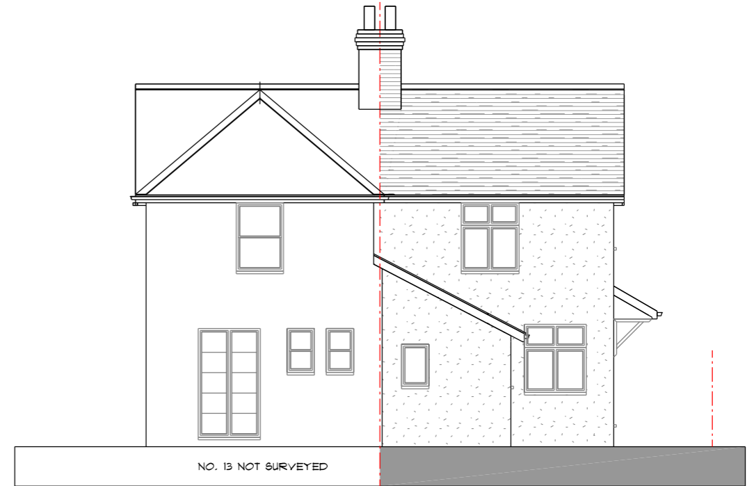
EXISTING REAR ELEVATION - NORTH Scale 1:100 @ A3

EXISTING SURVEY ELEVATIONS - MARCH 2022 - DWG NO. ADP/2167/P/02