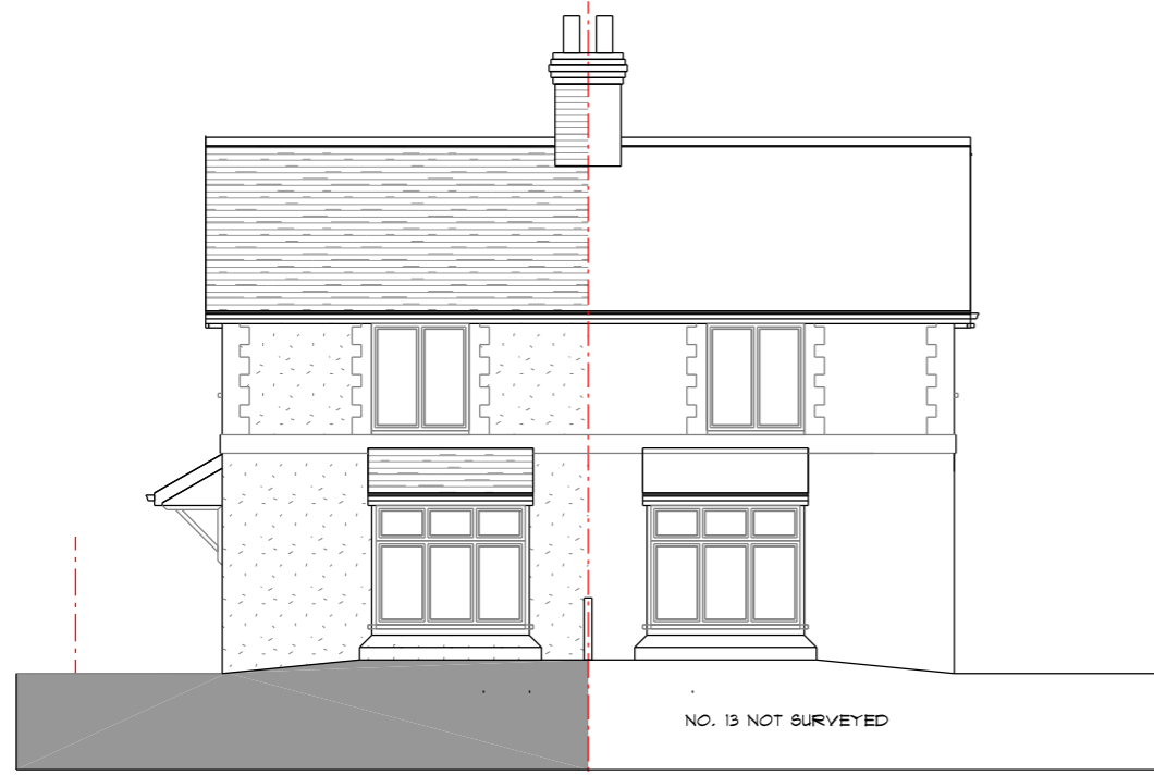
EXISTING FRONT ELEVATION - SOUTH Scale 1:100 @ A3