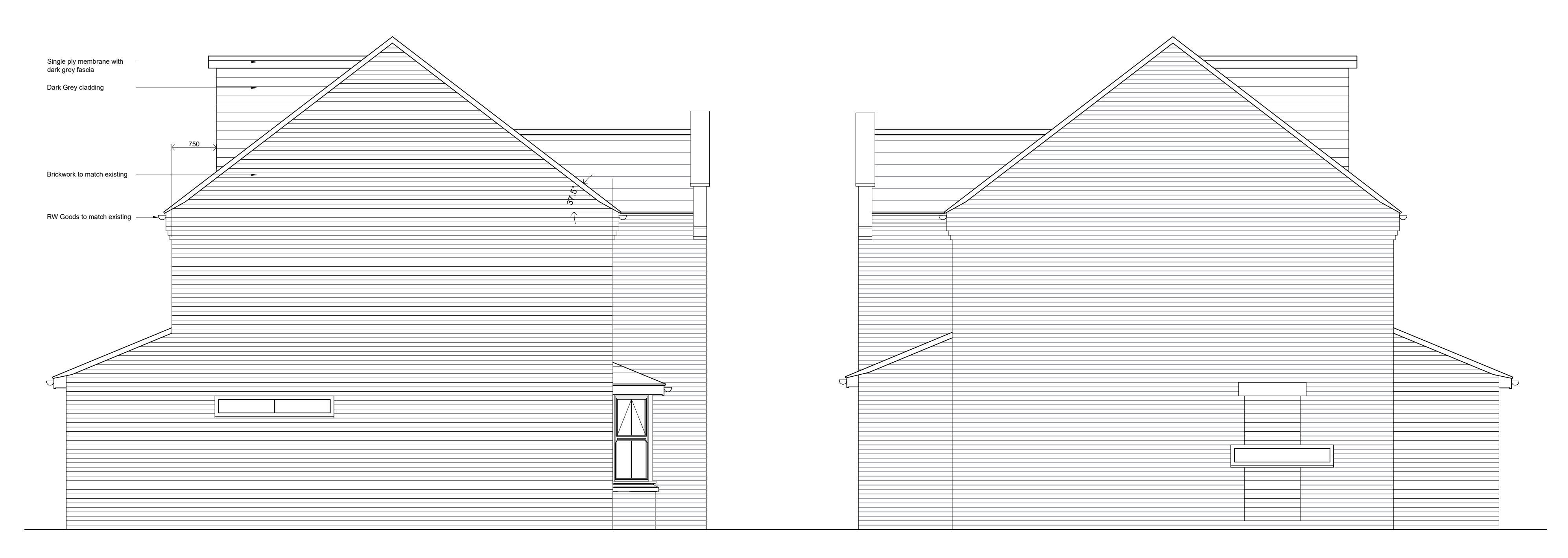
PROPOSED SIDE ELEVATION (1:50)