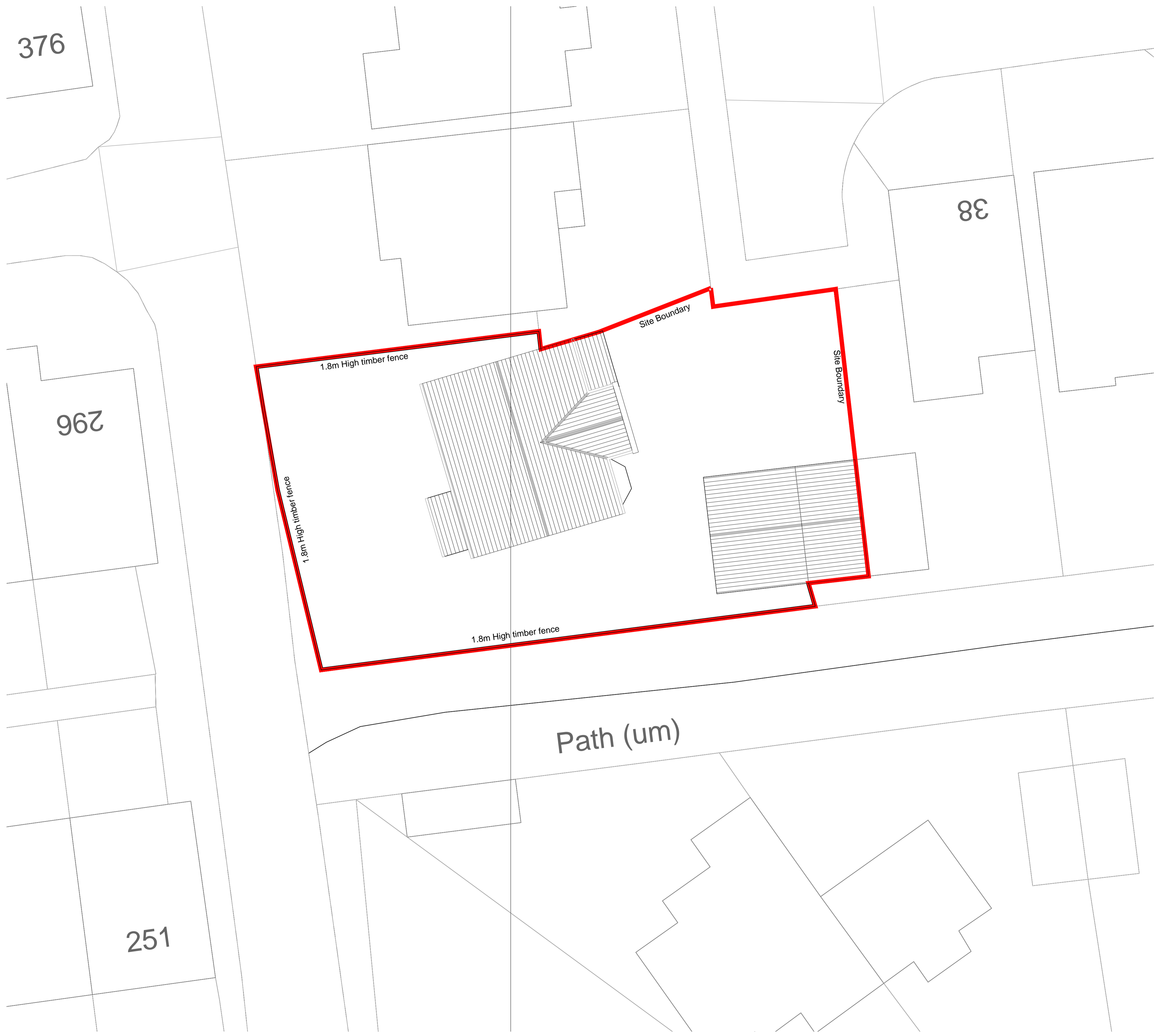
Existing Site Plan (1:100)