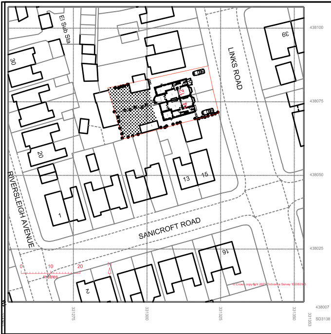
Scale : 1:1250