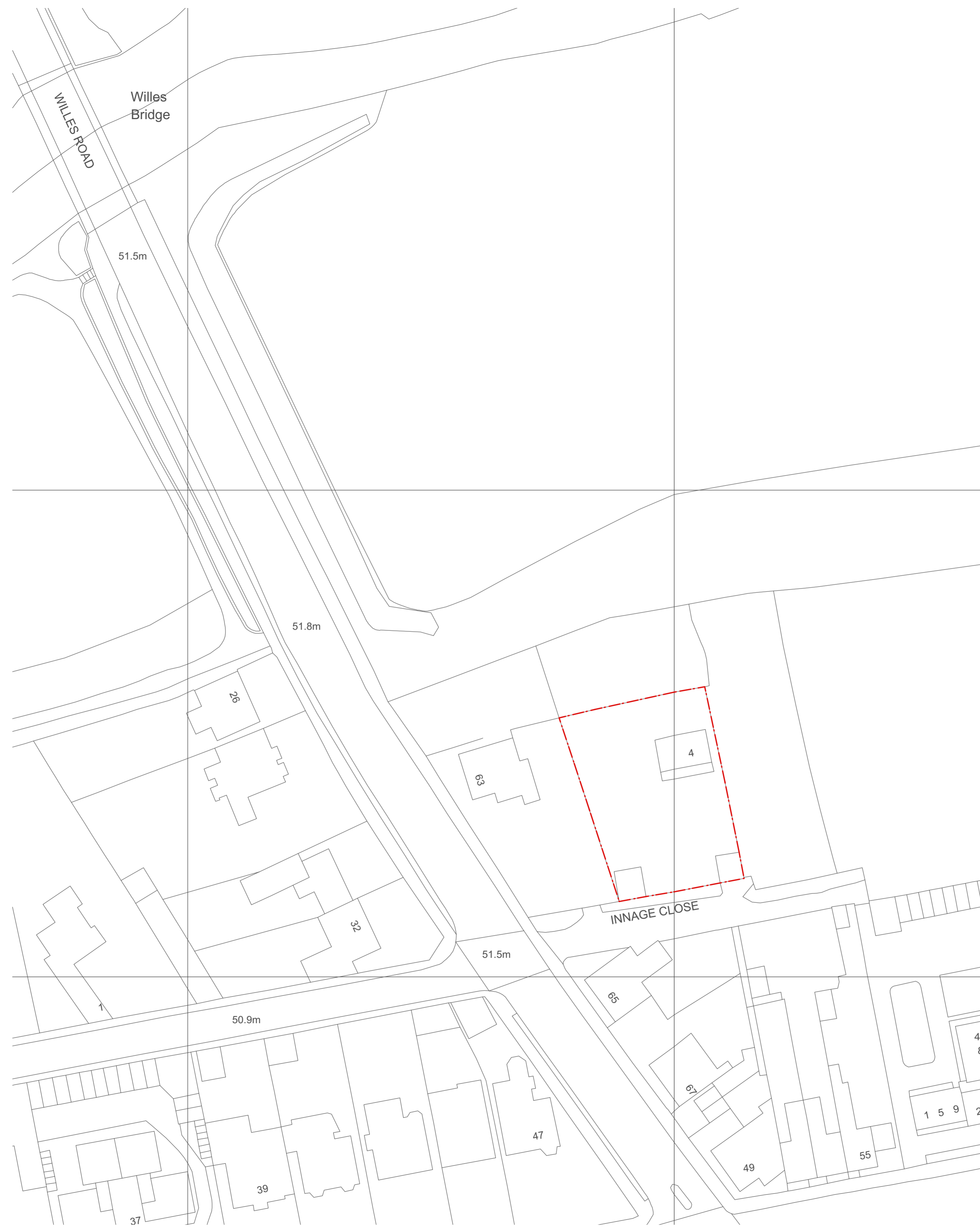
SITE LOCATION PLAN SCALE 1:500 @ A1

Data provider - Ordnance Survey Data provider copyright : © Crown Copyright and database rights 2020. OS 100031961 Approximate last update of dataset : March 2020 Approximate update frequency of dataset : 6-8 weeks Coordinate reference system : British National Grid (OSGB36/E)