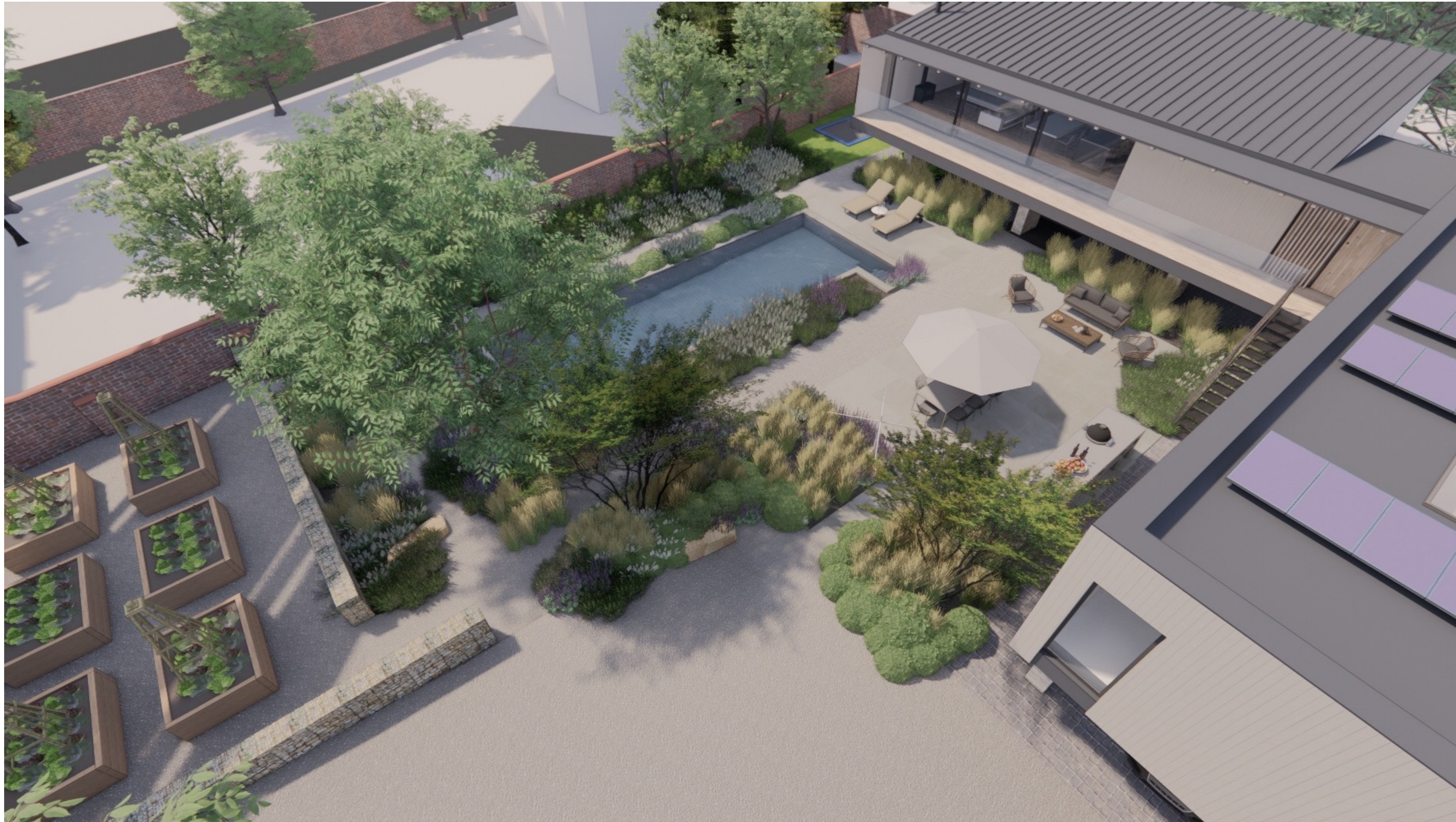
Aerial view of proposed garden