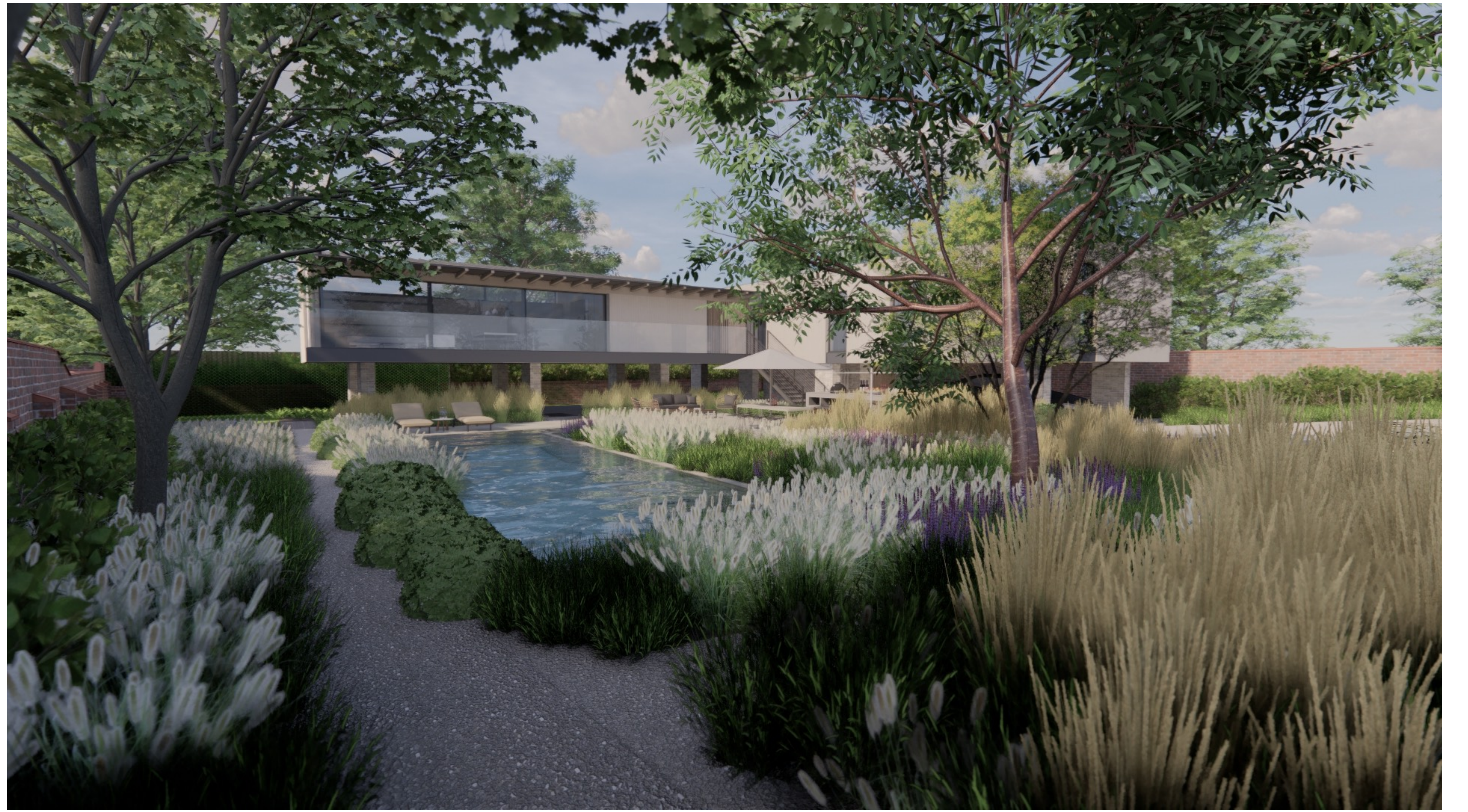
Gravel and natural planting areas