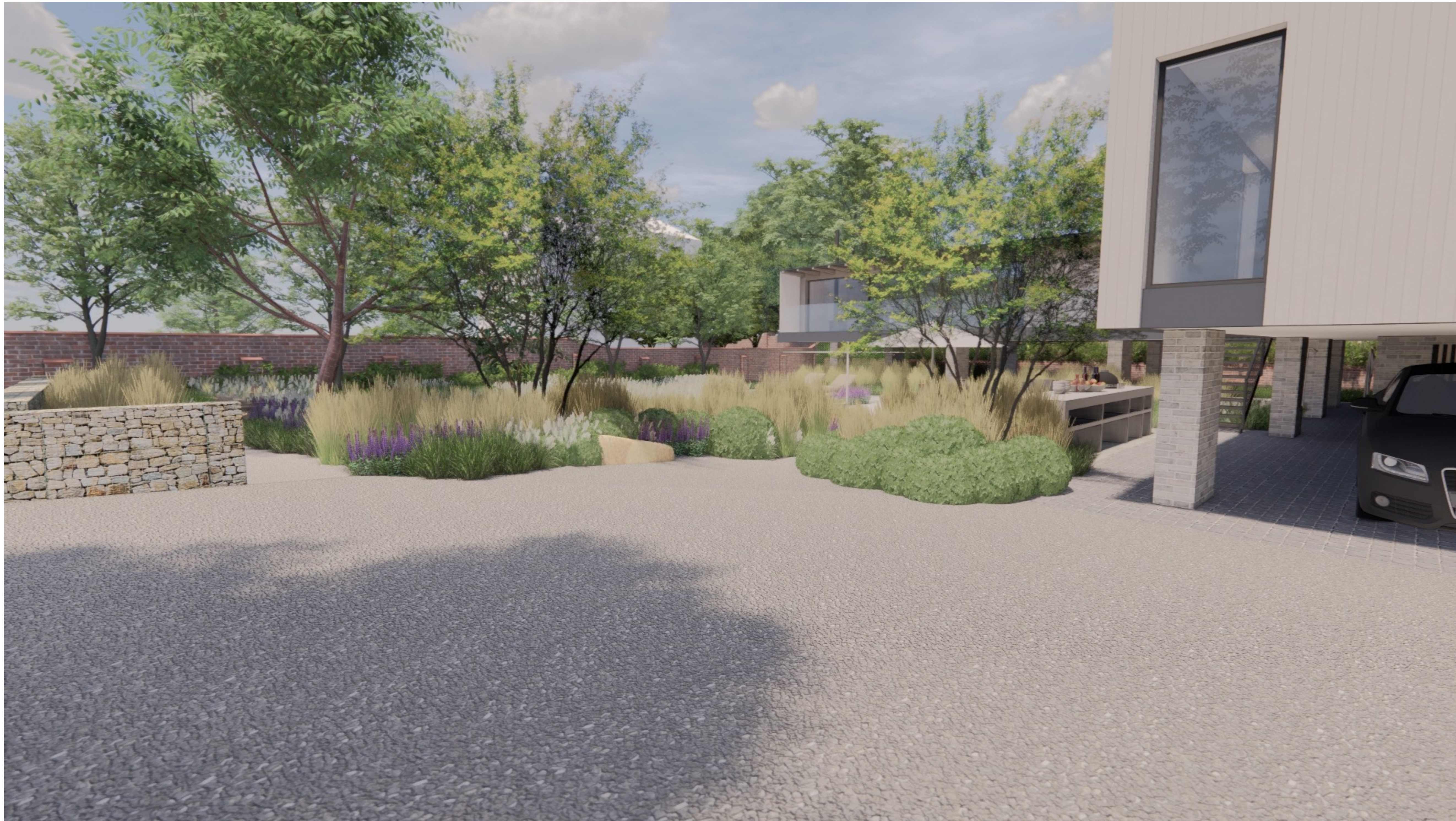
Gravel and natural planting areas