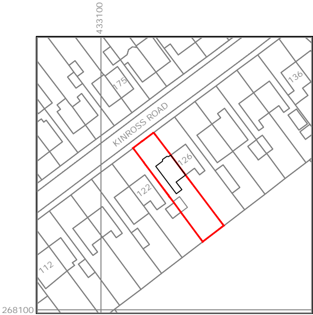
Location Plan @ 1:1250

Windows and Doors to closely match existing frame style