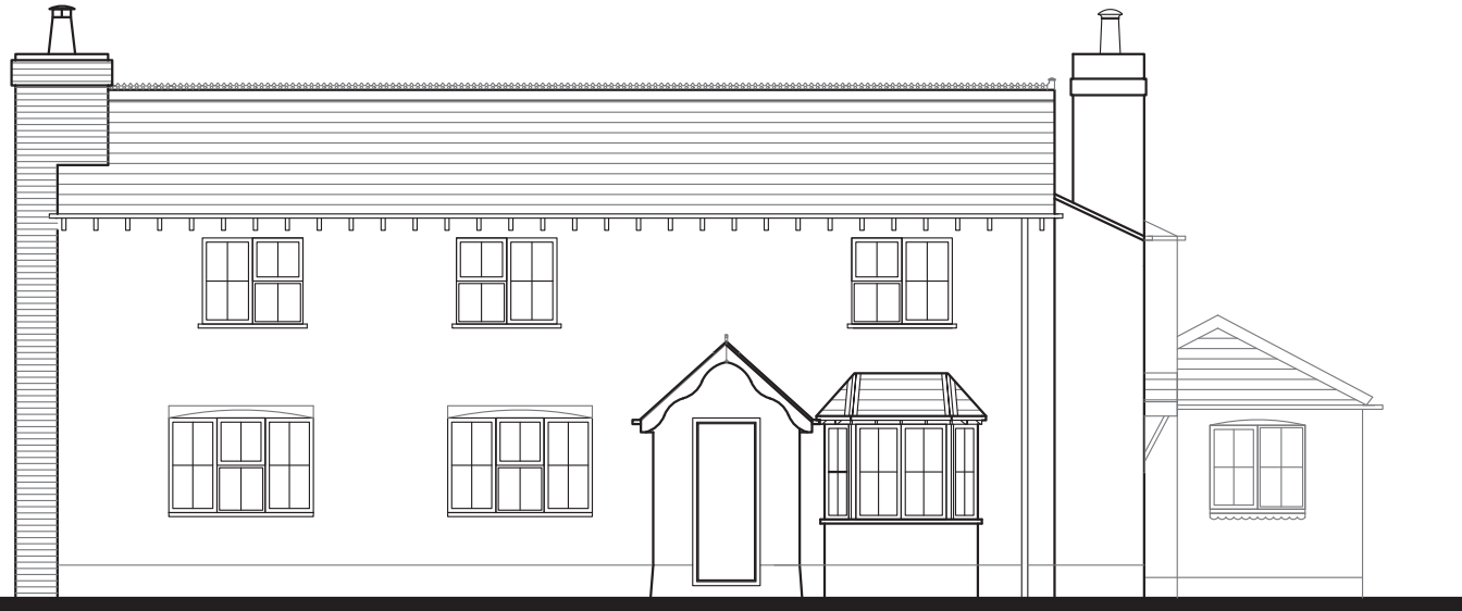
EXISTING (NORTH WEST) ELEVATION