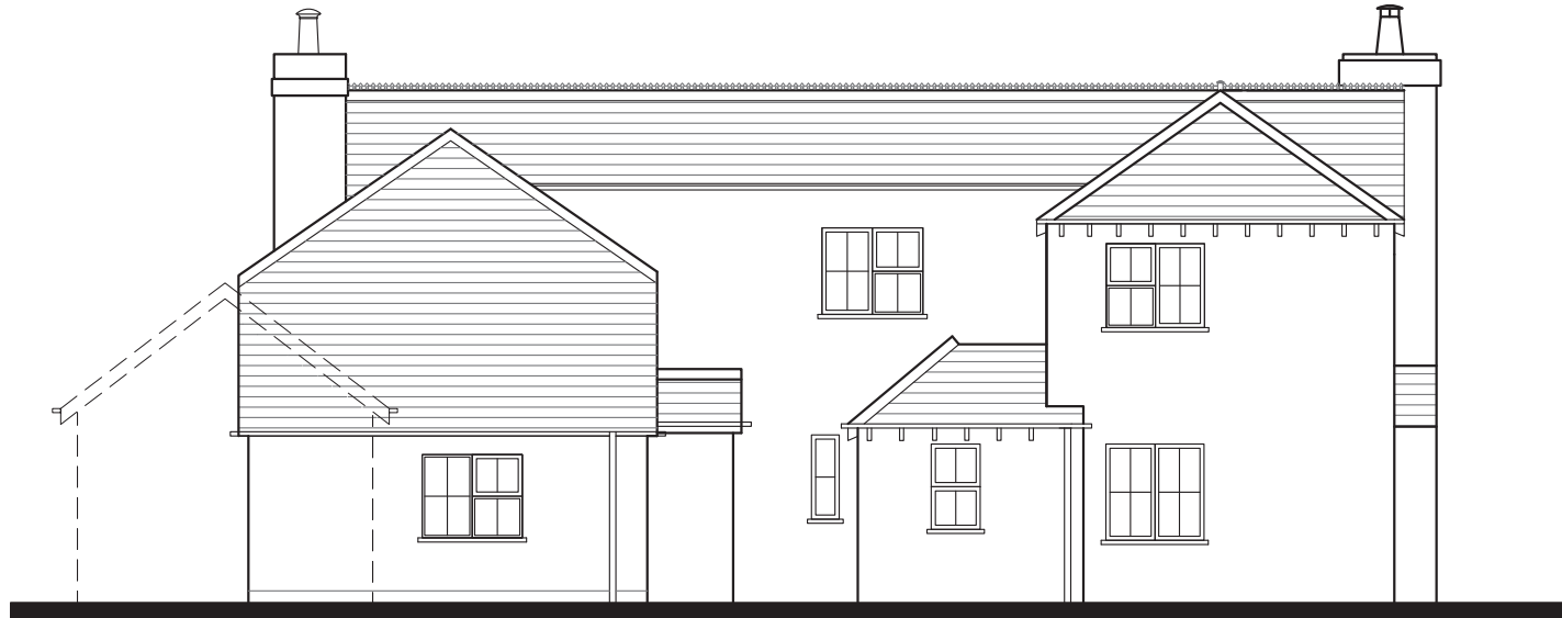
EXISTING (SOUTH EAST) ELEVATION MAIN HOUSE