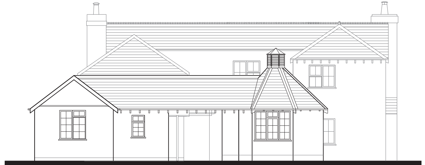
EXISTING (SOUTH EAST) ELEVATION ANNEX & SUMMER HOUSE