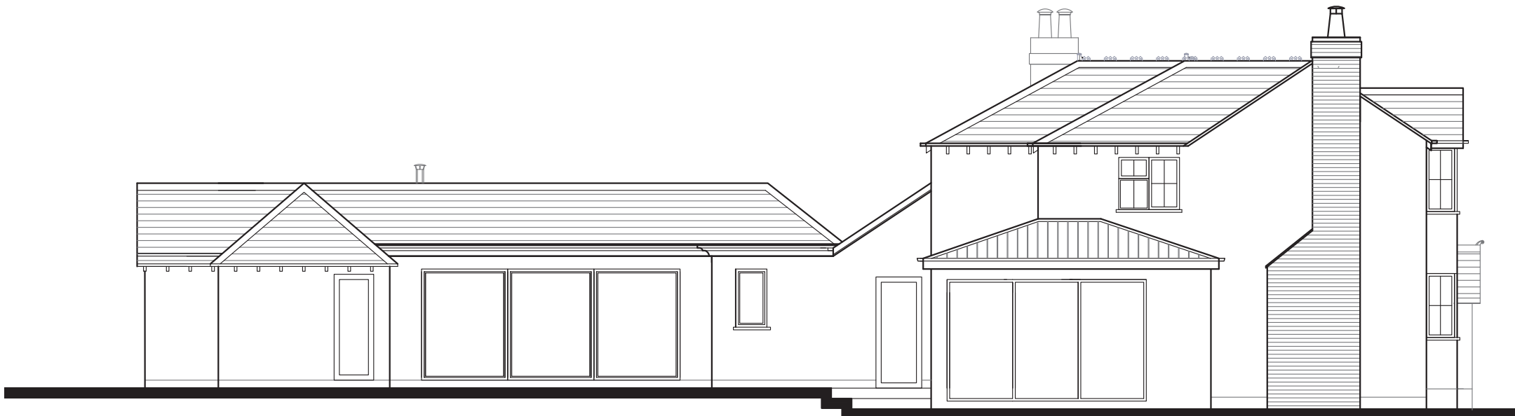
PROPOSED (NORTH EAST) ELEVATION