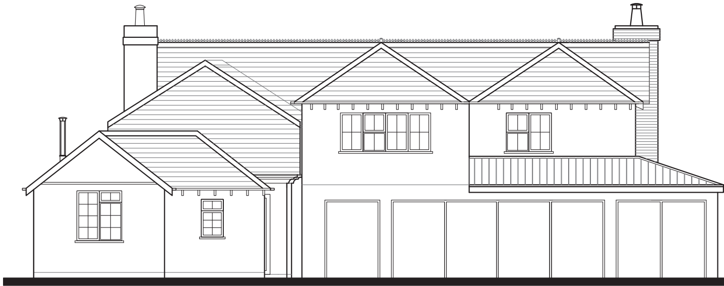
PROPOSED (SOUTH EAST) ELEVATION