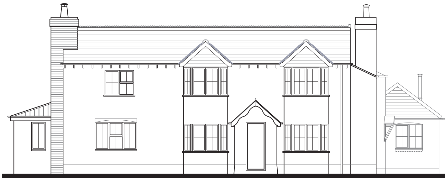
PROPOSED (NORTH WEST) ELEVATION