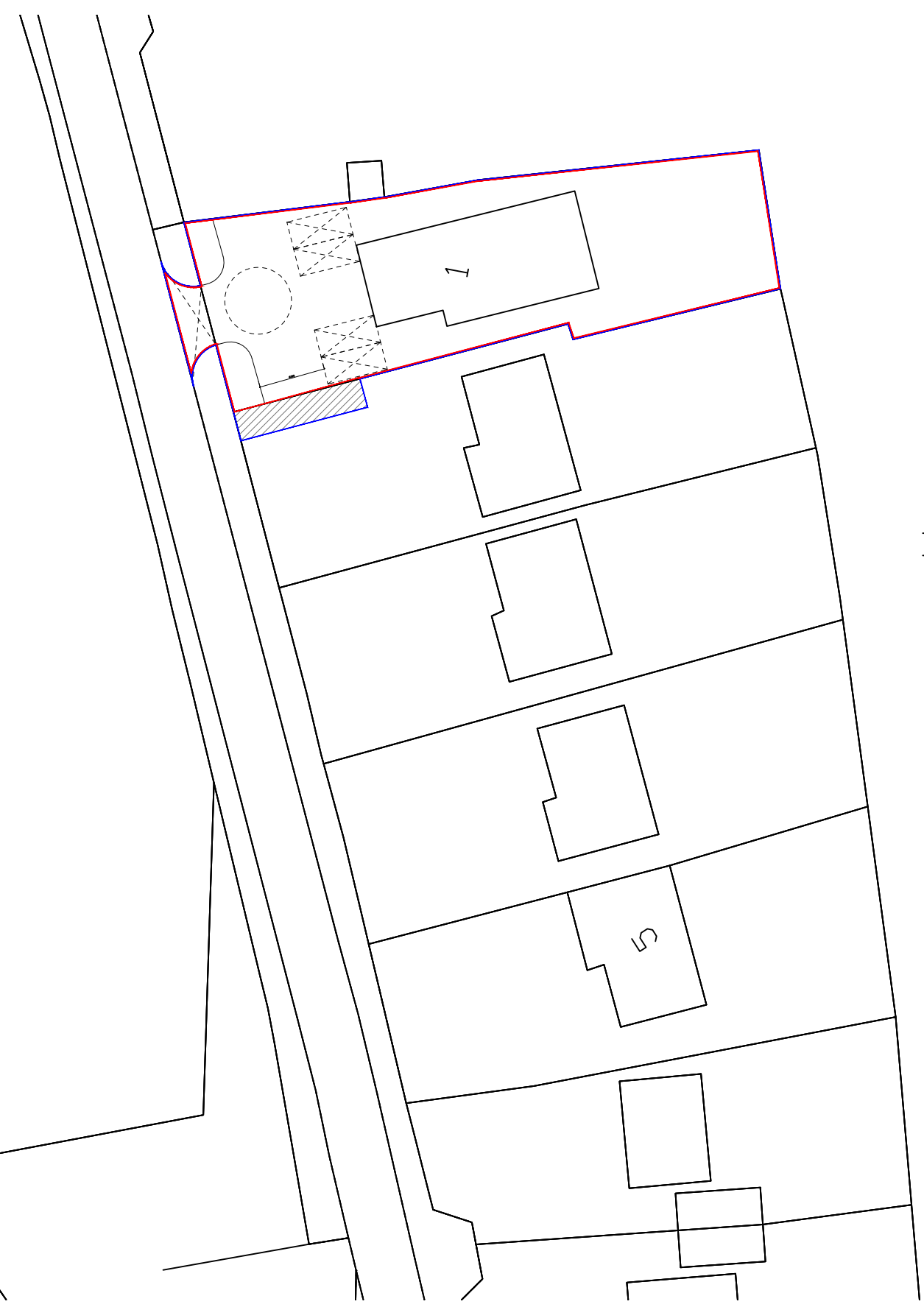
1:500 Existing Site Plan

TAB Architecture Ltd 41E Forehill, Ely, Cambridgeshire, CB7 4AA email: info@tabarchitecture.co.uk tel: 01638 505365