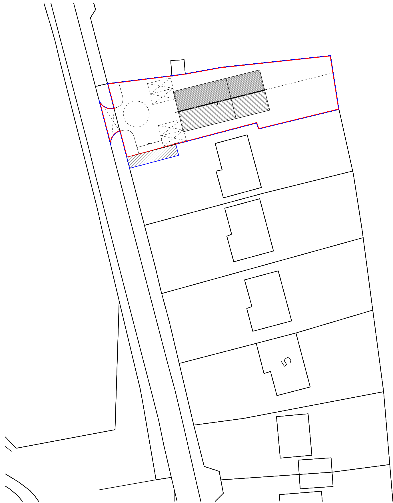
1:500 Proposed Site Plan