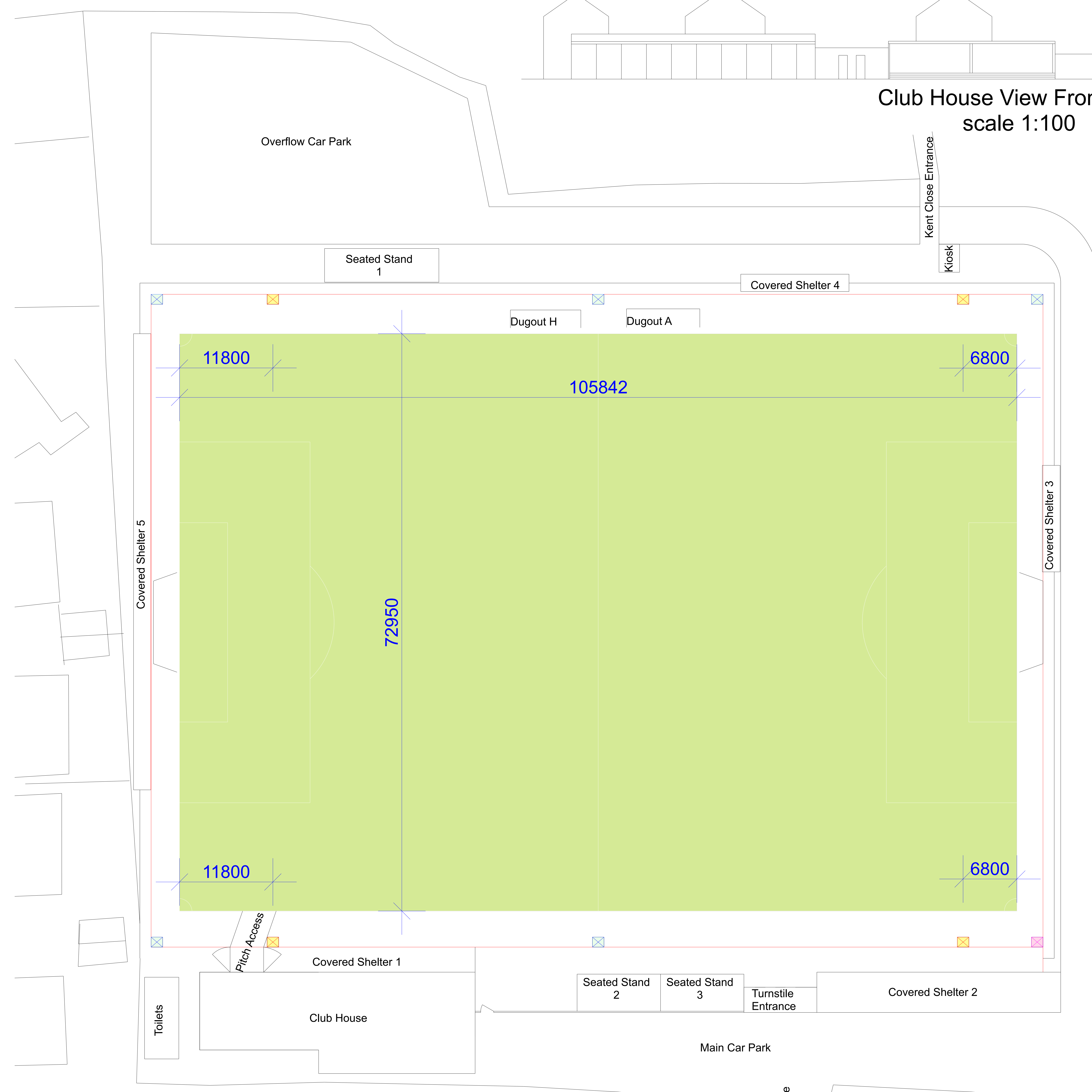
Site Plan scale 1:100