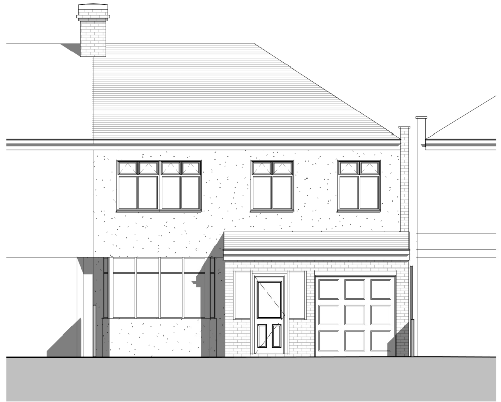
1 North Elevation Existing 1 : 100