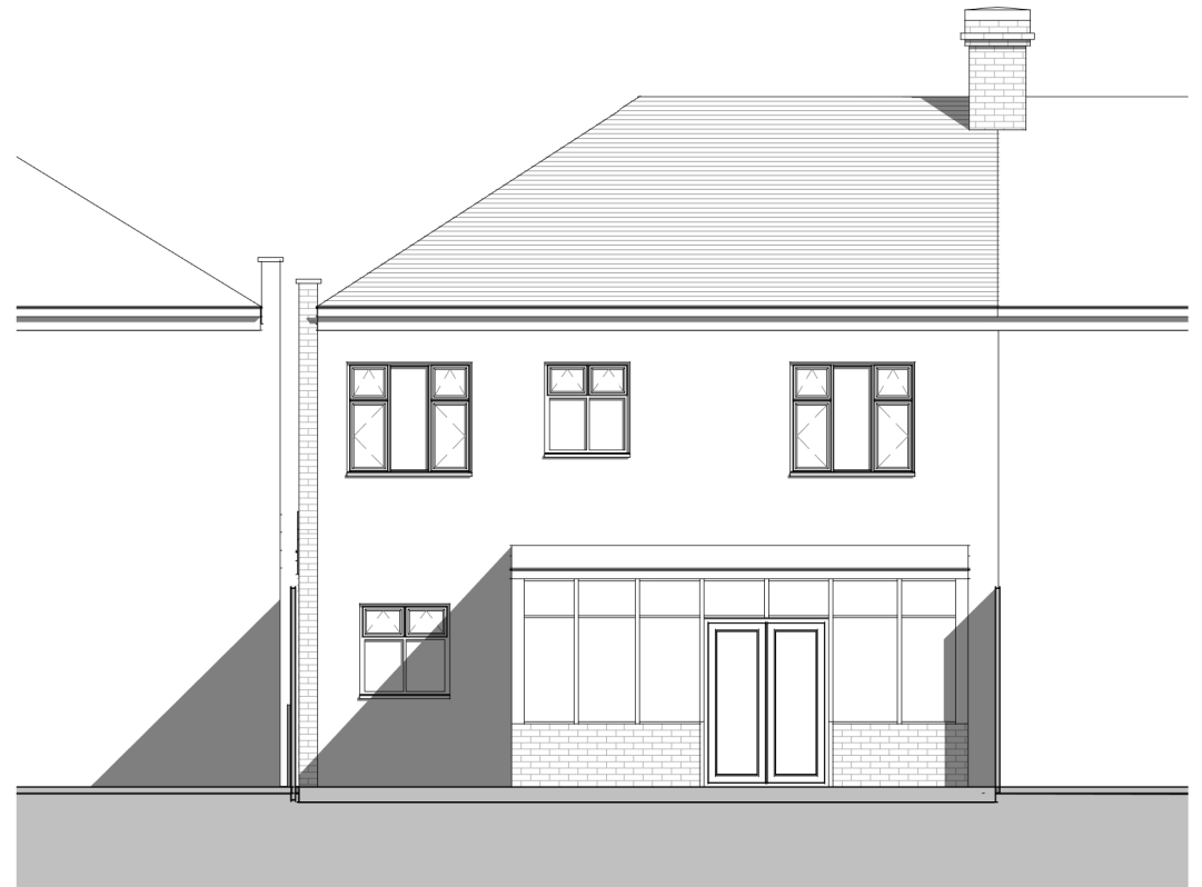
2 South Elevation Existing 1 : 100