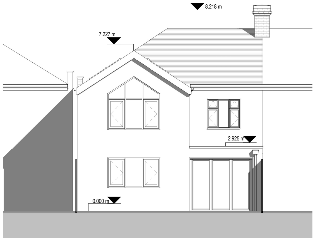
3 South Elevation - Proposed 1 : 100