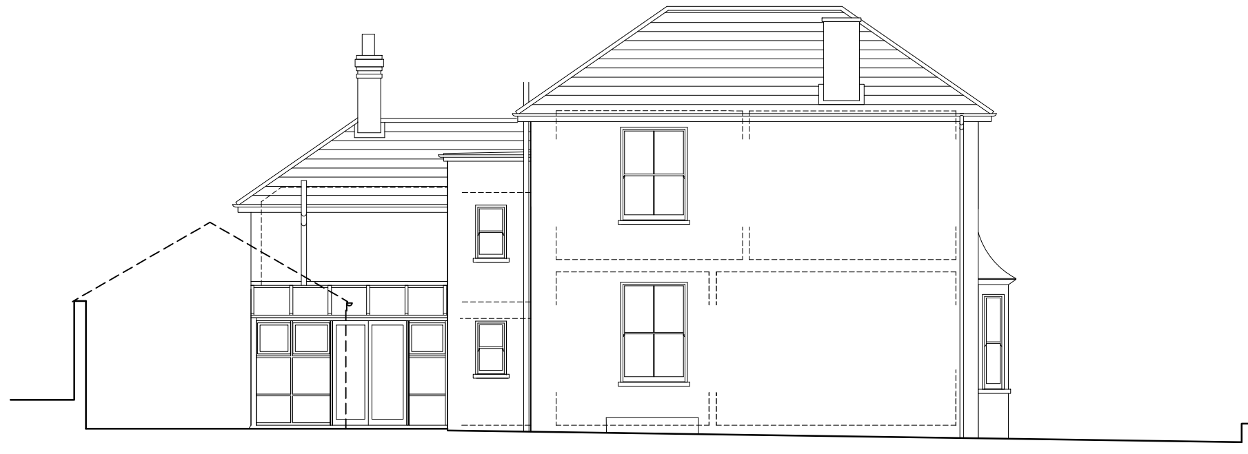
EXISTING NORTH EAST ELEVATION

Rev A – Issued for planning permission – 17.03.2022