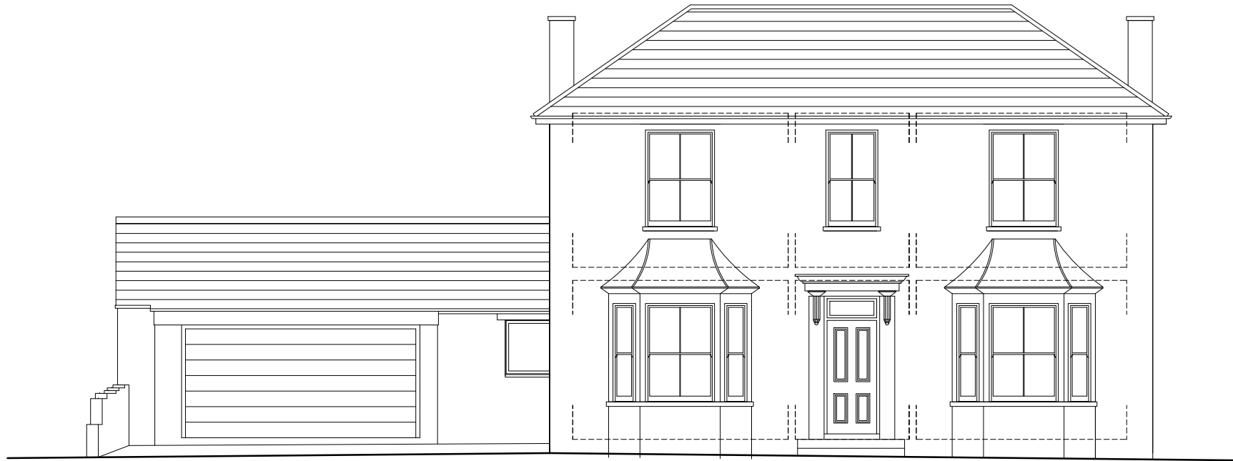
EXISTING NORTH WEST ELEVATION