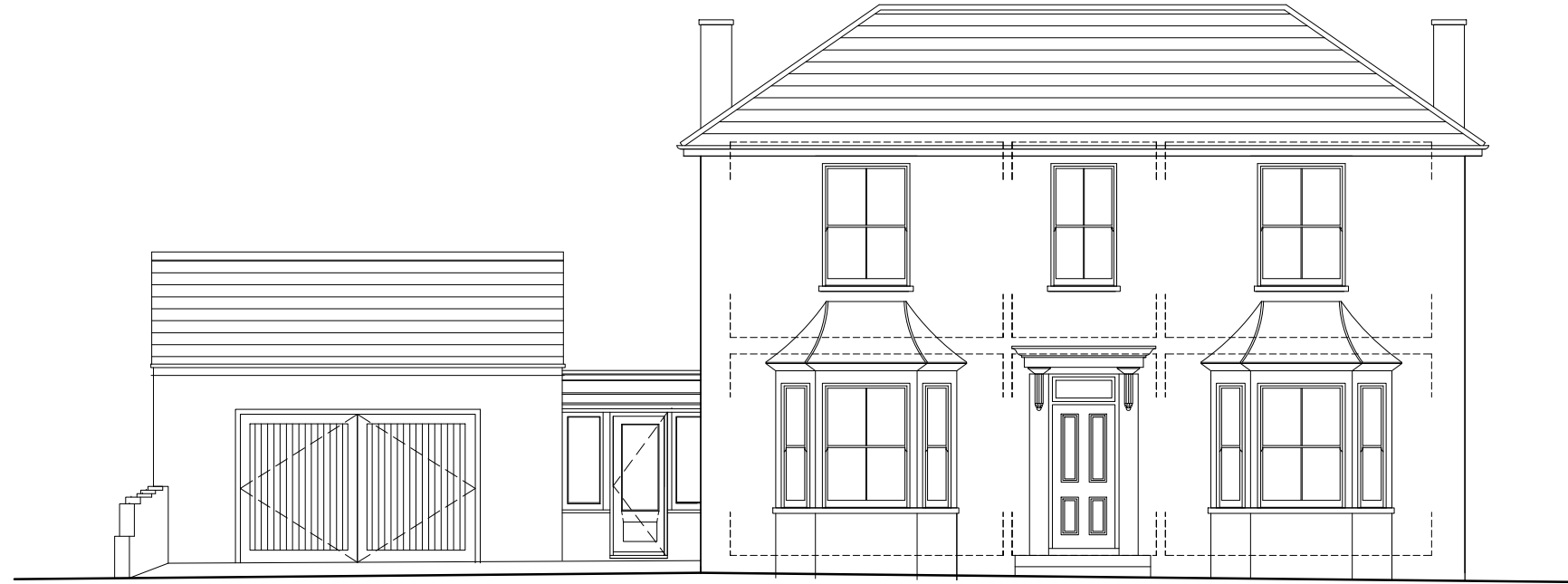
PROPOSED NORTH WEST ELEVATION