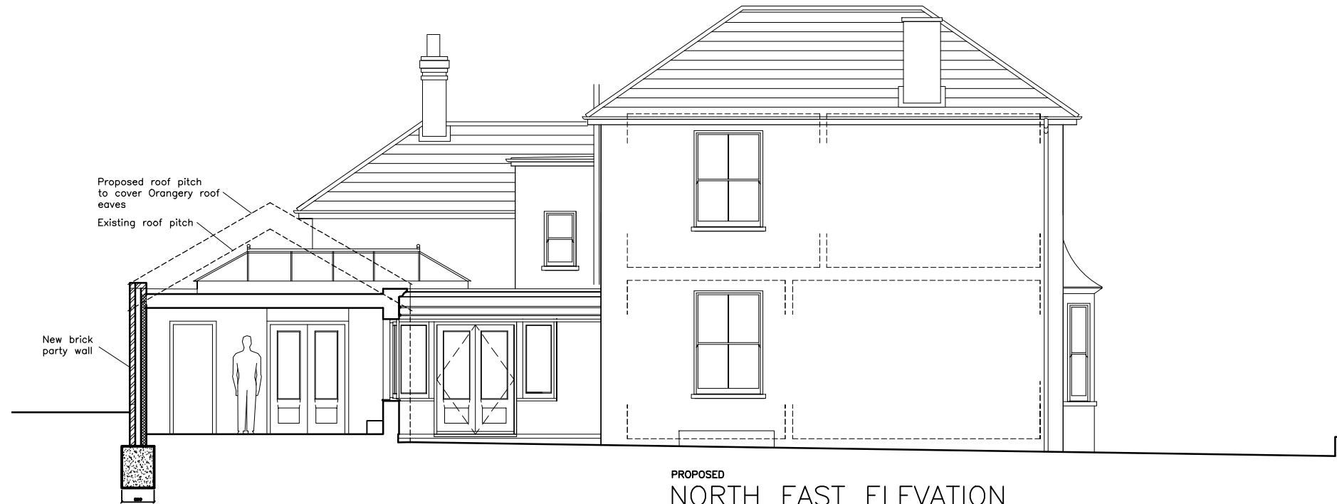
PROPOSED NORTH EAST ELEVATION

Rev B – Issued for planning permission – 08.04.2022