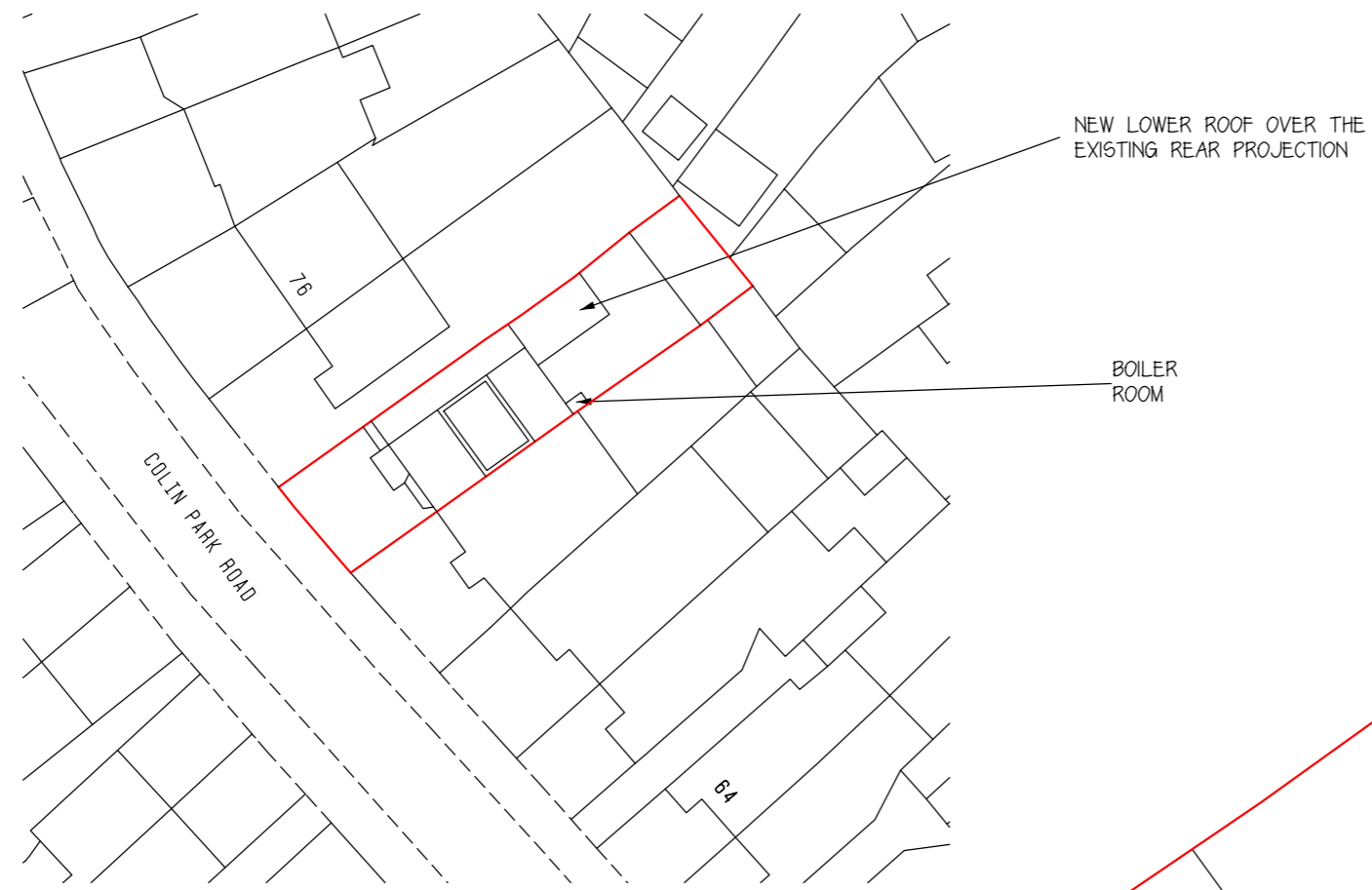
1:500 SITE PLAN