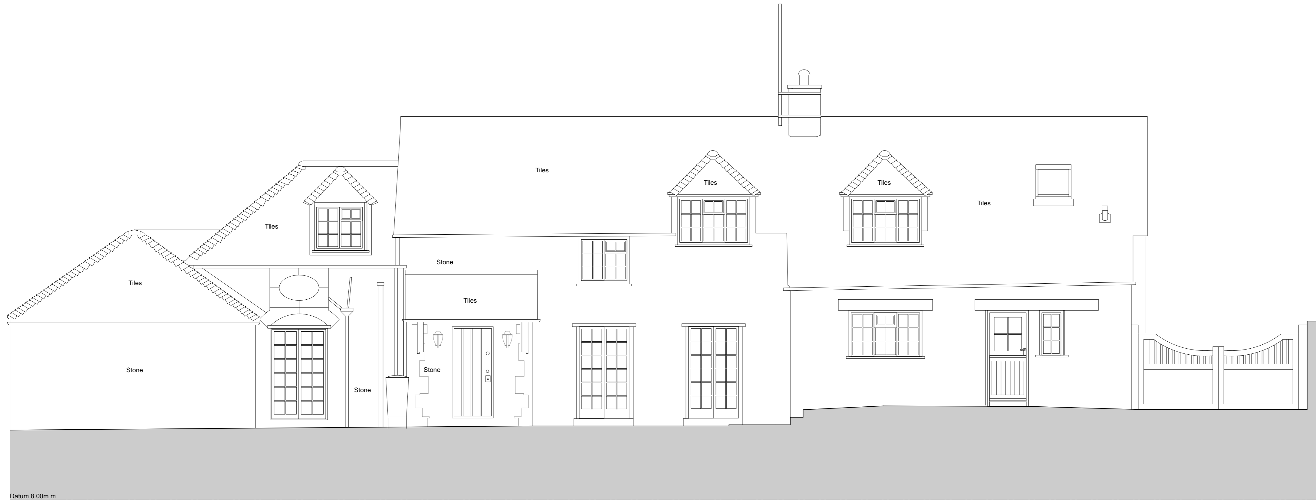
Datum 8.00m m WEST ELEVATION