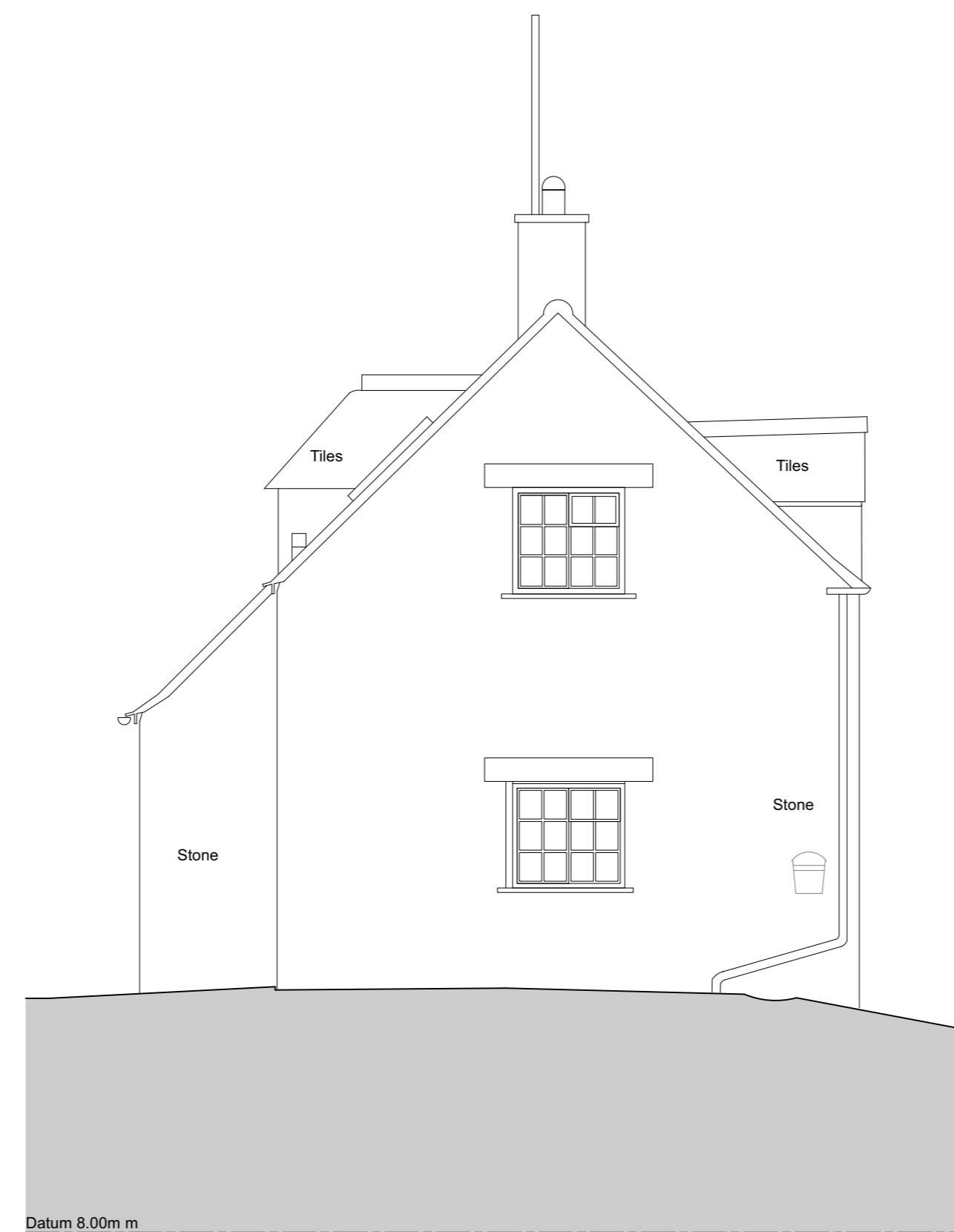
Datum 8.00m m SOUTH ELEVATION