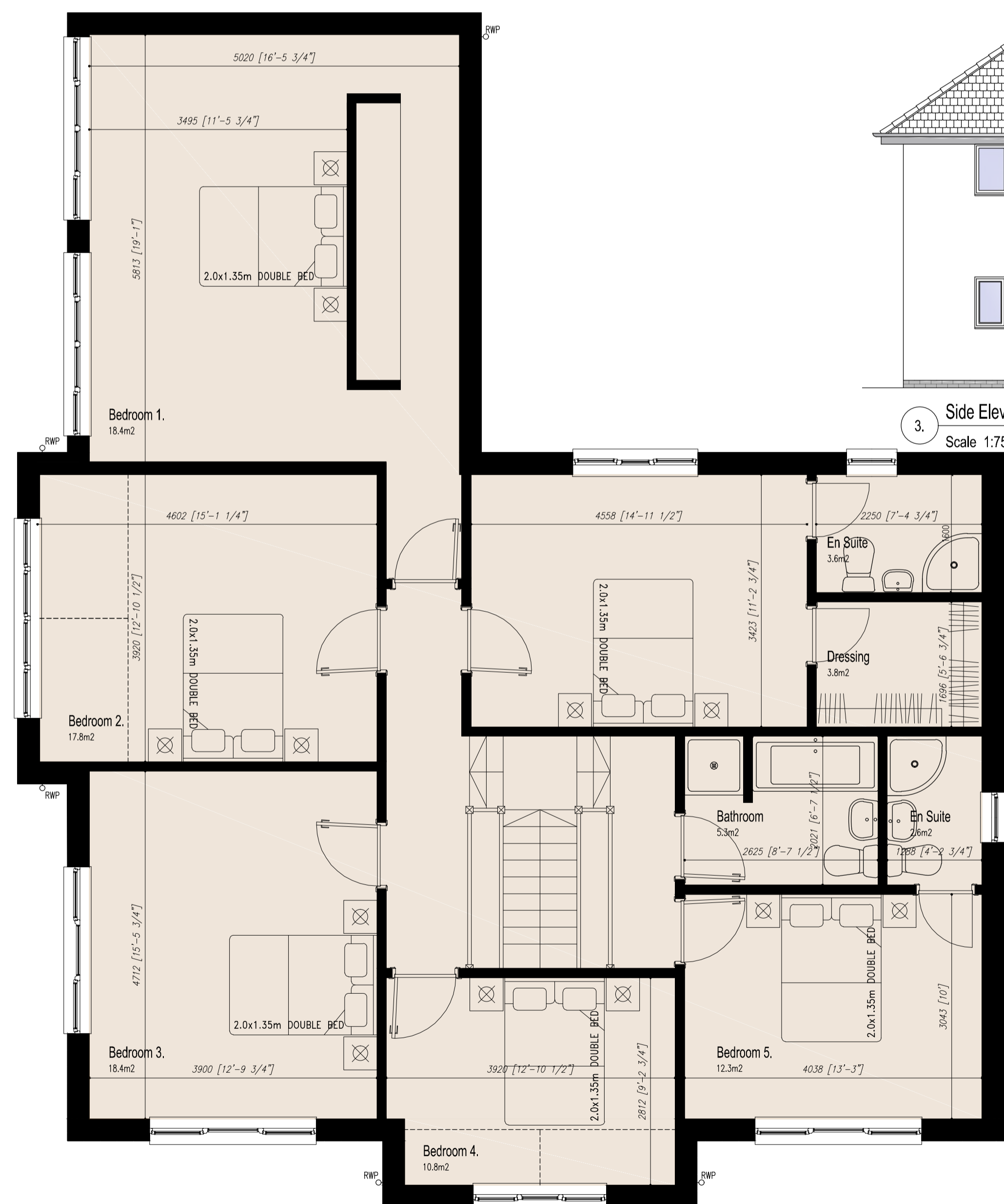
6. Upper Floor Plan Scale 1:50

NOTES 1. DO NOT SCALE FROM THIS DRAWING. 2. ALL DIMENSIONS TO BE CHECKED ON SITE. 3. ALL DRAWINGS TO BE READ IN CONJUNCTION WITH ALL STRUCTURAL ENGINEERS DETAILS & SPEC. A STRUCTURAL ENGINEER MUST APPROVE ALL DRAWINGS BEFORE ANY WORK COMMENCES. 4. ANY DISCREPANCIES TO BE REPORTED TO W.B. PROPERTIES IMMEDIATELY. 5. DRAWINGS ARE INDICATIVE ONLY & ARE NOT PART OF ANY CONTRACT UNLESS OTHERWISE STATED. THESE DRAWINGS ARE A TRUE REPRESENTATION/COPY OF THE APPLICATION SUBMITTED. BY _____ DATED _____