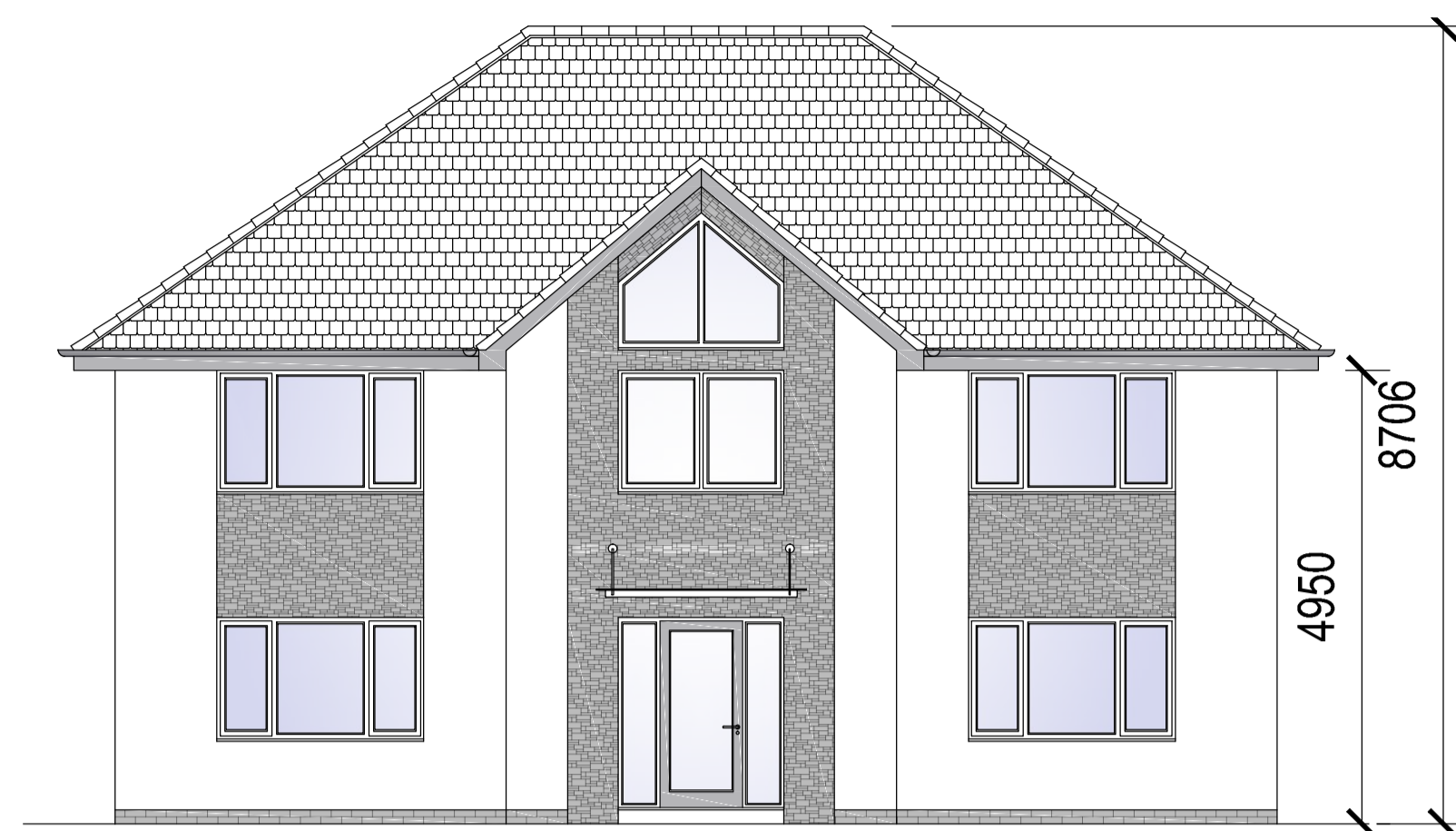
2. Front Elevation Scale 1:75