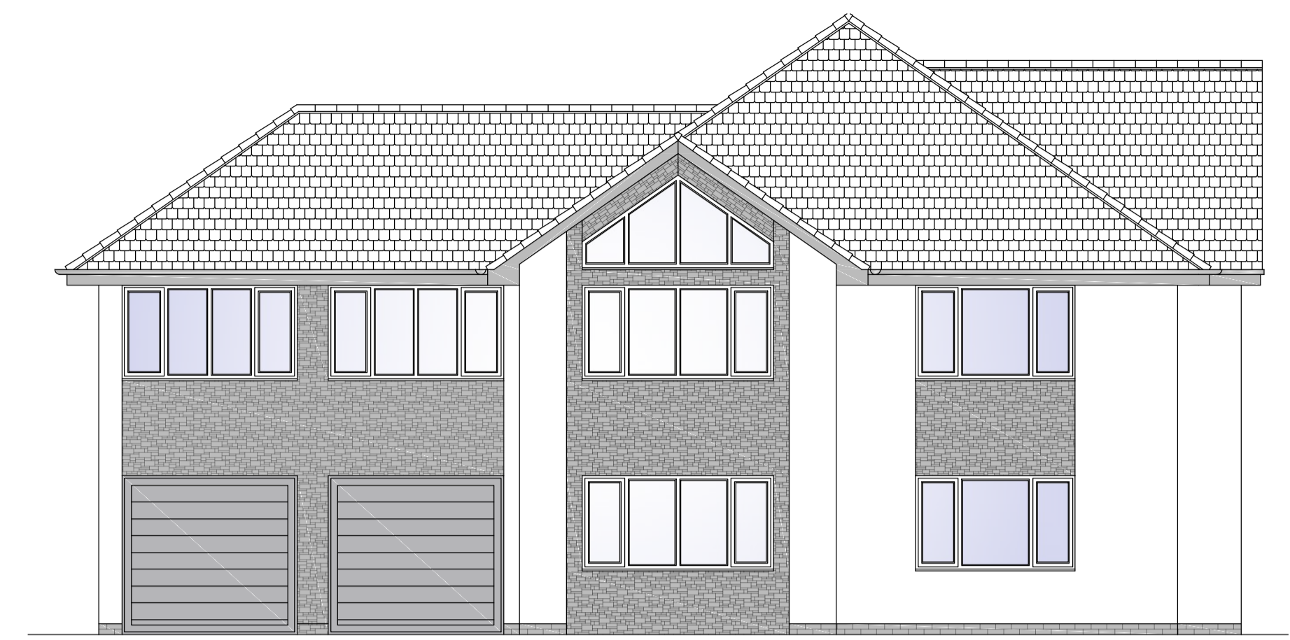
1. Front Elevation Scale 1:50