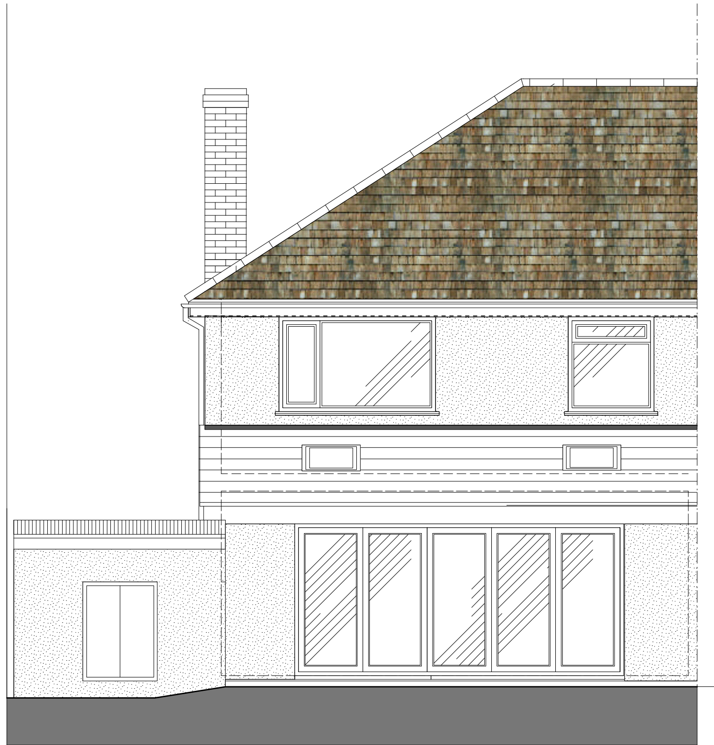
EXISTING REAR ELEVATION SCALE 1:50