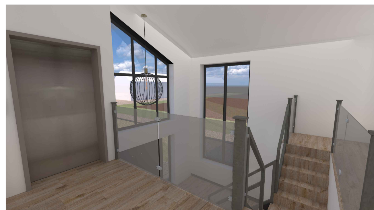
Proposed Internal Visuals (n.t.s)