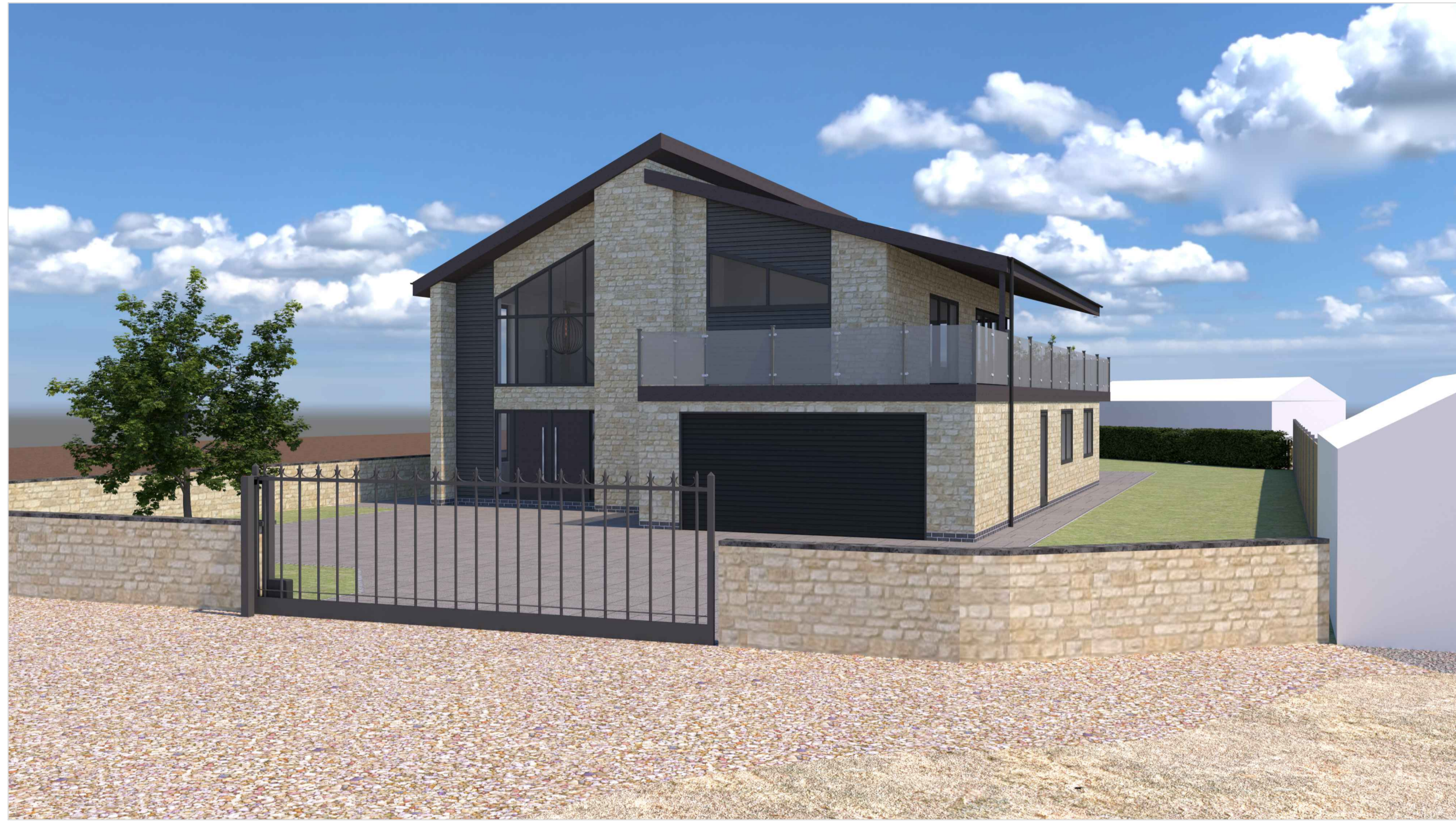
Proposed Front Visuals (n.t.s)