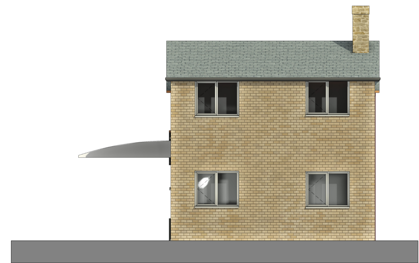
2 Rear Elevation TD-08 70 02 1:50