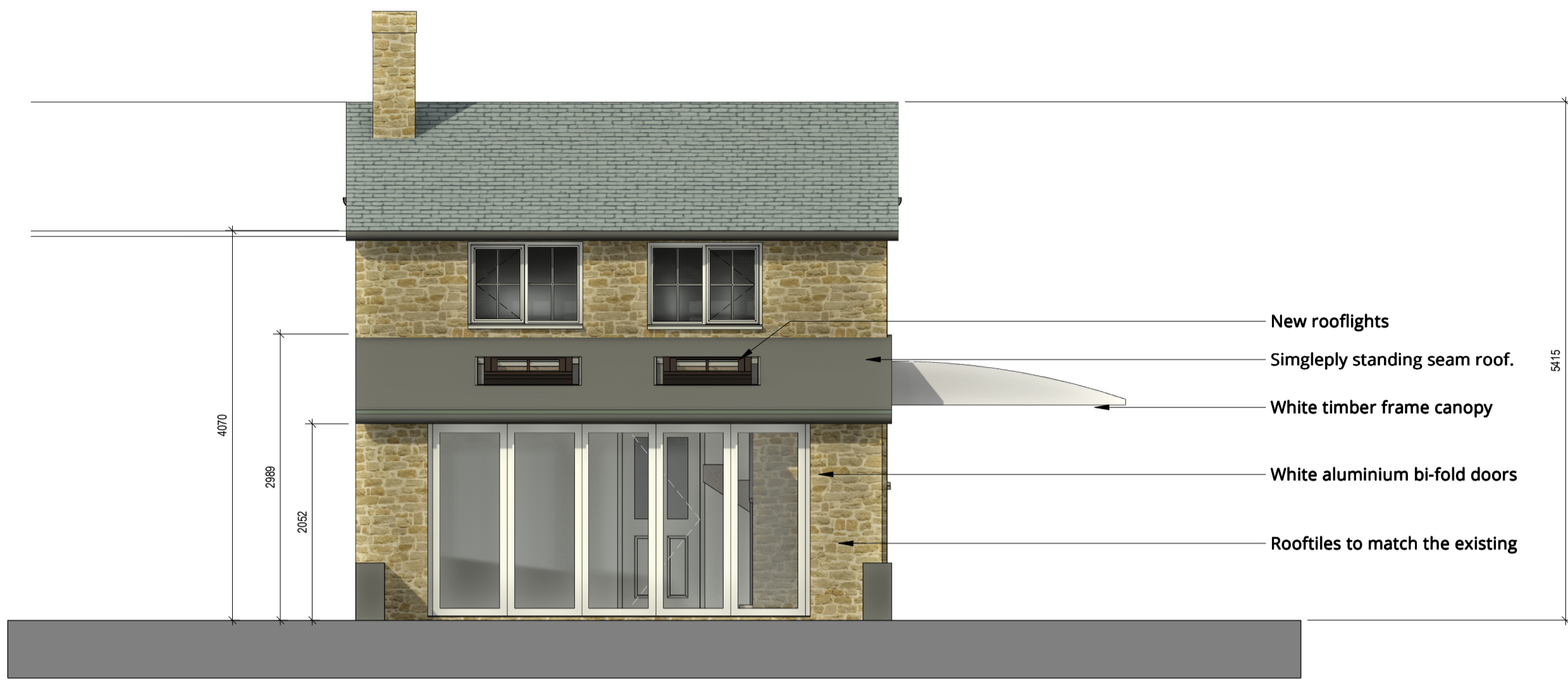
3 Front Elevation TD-08 70 02 1:50