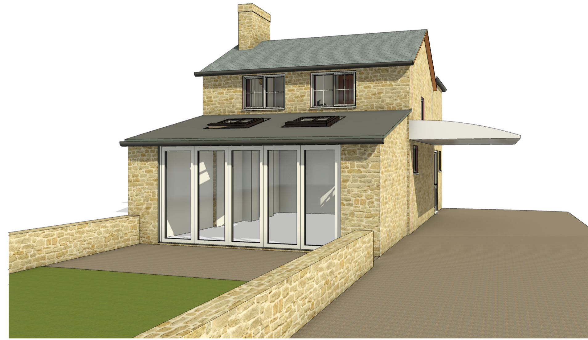
4 3D View 1 TD-08 70 02