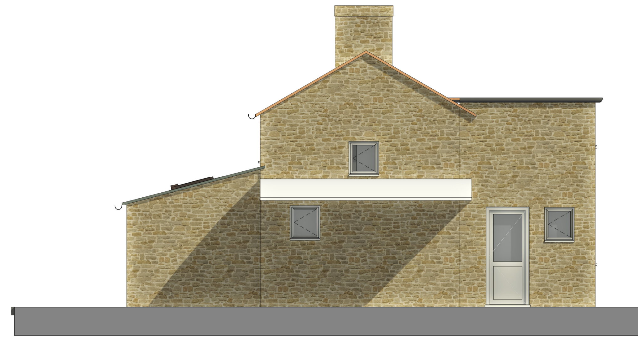
1 Side Elevation TD-08 70 02 1:50